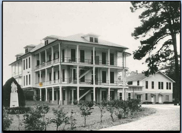
The first dormitory building, built in 1911