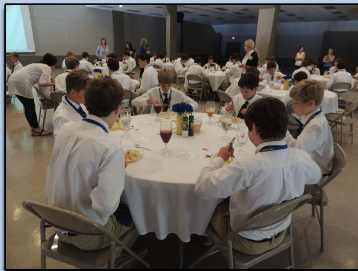
Students learn the proper way to eat pasta.