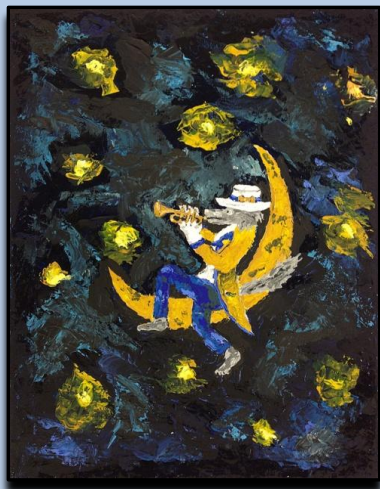
Painted by Dominick Alongi '14