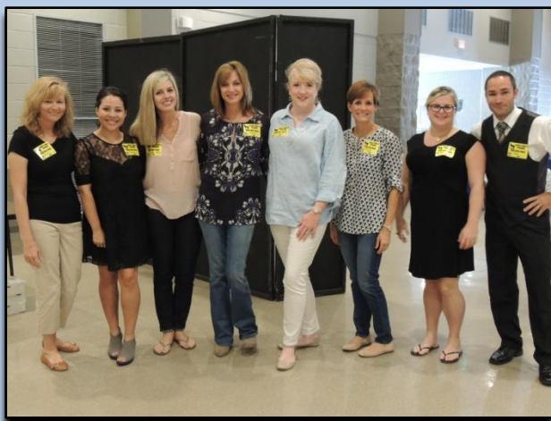
Each day parent volunteers assisted with serving the food and bussing the tables.