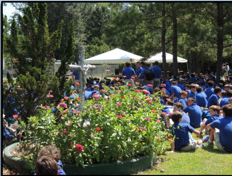
Students sit near the Katrina Cross during the prayer service.

On Friday, August 28 th , the faculty and student body gathered on the lawn in front of the Katrina Cross for a prayer service. This cross is located on the land directly across from the Retired Brothers Residence. Before Hurricane Katrina, this land was a grove of tall pines. Saint Paul's area campus lost almost 200 pine trees from the storm.