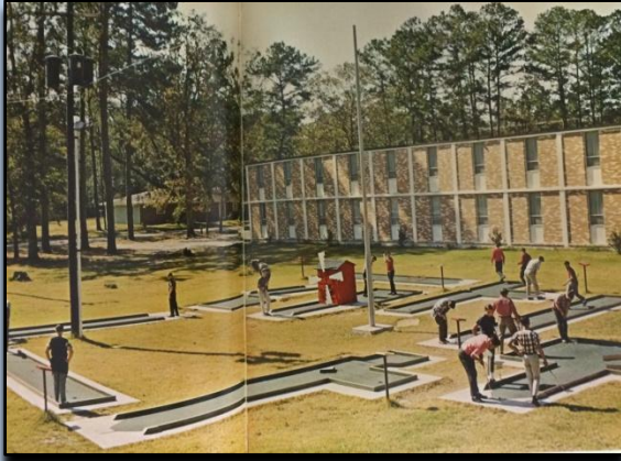
Mini Golf Course was located next to the existing band room