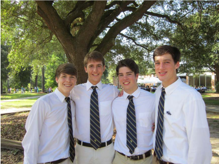
Seniors enjoy breakfast following March through the Arch

Full of sorrow, Augustine flung himself out to the garden and cried, "How long more, O Lord? Why does not this hour put an end to my sins?" Then he heard a child singing, "Take and read!" Thinking that God intended him to hear those words, he picked up the Letters of St. Paul, and read the first passage. It was just what he needed, for in it, St. Paul says to put away all impurity and to live in imitation of Jesus. That did it! From then on, Augustine began a new life.