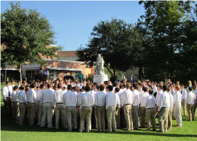
After marching through the arch, seniors sing "Rise Up O Men of God" at Founder's statue.