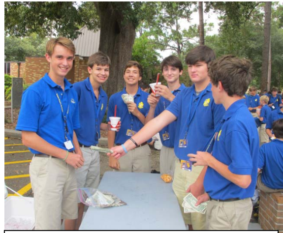
LYLs sell smoothies to support Cov Food Bank.