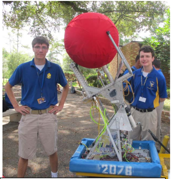
Robotics Club members show off Robbie as they recruit new members on GID!

October 31 – Day of the Dead ceremony – Assembly Schedule