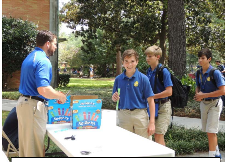
Students enjoy “popsicle day” at the Advancement Office.

As you can see, food played a major role in the Senior Week events!