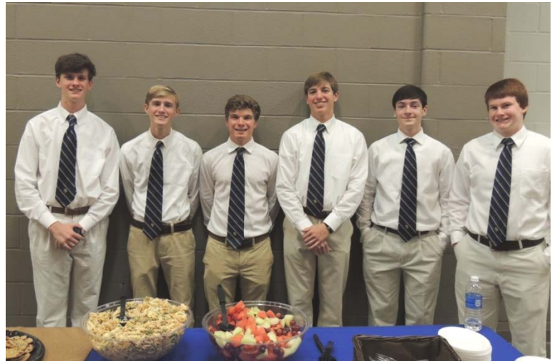
Student hosts assist at New Parent Reception