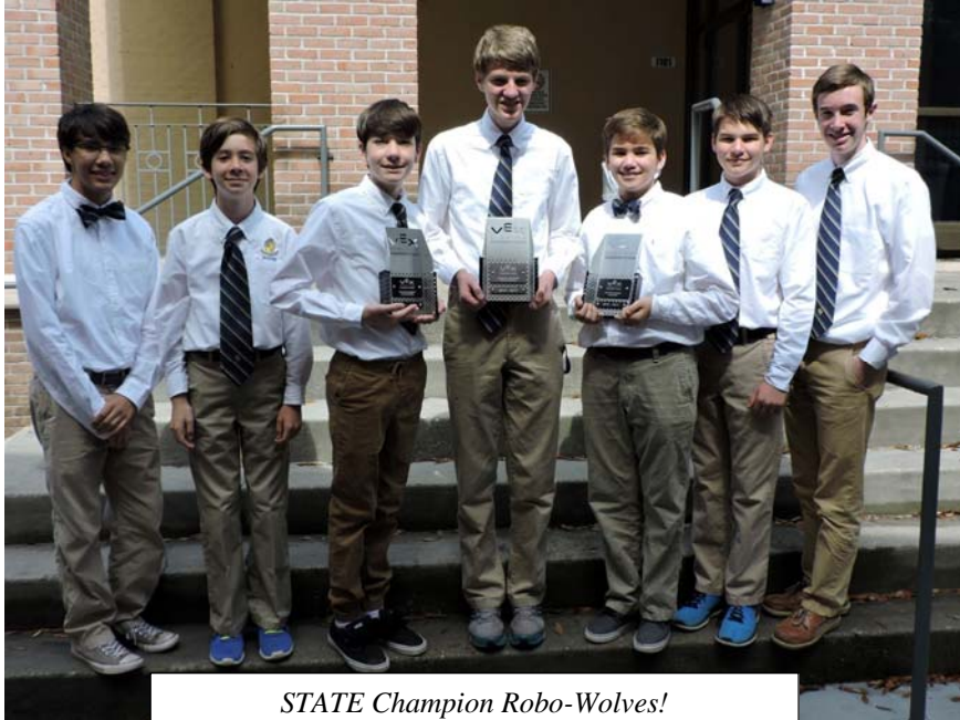
STATE Champion Robo-Wolves!