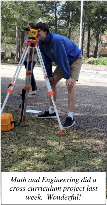
Math and Engineering did a cross curriculum project last week. Wonderful!