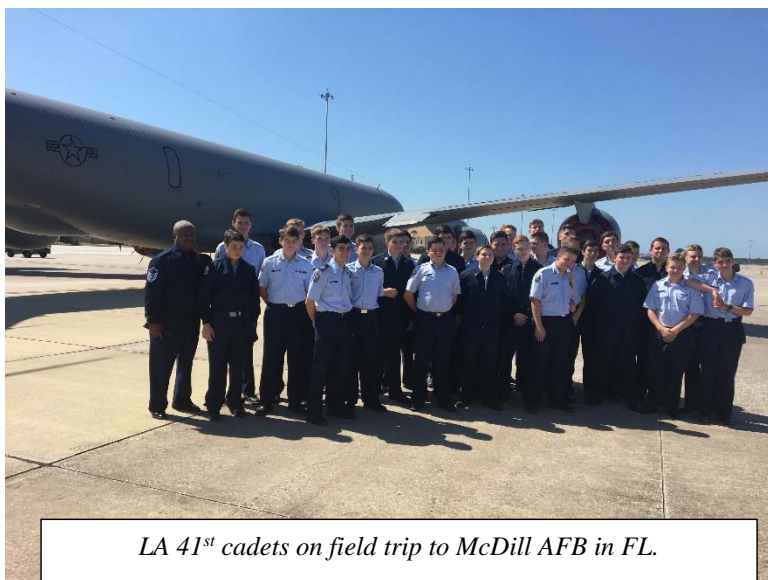
LA 41 st cadets on field trip to McDill AFB in FL.

Important 2017 – 18 Calendar Change: We learned last week of two first semester events that necessitate a change in next year’s calendar. Because of a Lasallian formation experience for the four Lasallian schools in the New Orleans area on Sep 1 and an Archdiocesan All Catholic School formation experience on Nov 6, we will now end the first semester on Tuesday, Dec 19, after the last exam. This still ends our semester a day before the public schools.