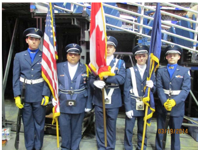
SPS AFJROTC prepares to present the colors at last week's NO Pelican / Toronto Raptor game. Note Canadian flag in addition to the US flag.

2014 Summer at Camp Abbey Seeking Staff: Camp Abbey, a ministry of the CYO/Youth & Young Adult Ministry Office of the Archdiocese of New Orleans, has begun preparations for its 2014 summer program and is seeking high school student applicants for junior counselor positions and graduating seniors, college students, and older for senior counselor and administrative positions. Although all positions are paid, staff may decline stipends in favor of service hours if applicable. Camp includes opportunities for prayer, Mass, the Sacrament of Reconciliation, and Eucharistic Adoration, as well as activities such as volleyball, basketball, softball, flag football, arts & crafts, archery, swimming, boating, performing arts, camping, and hiking.