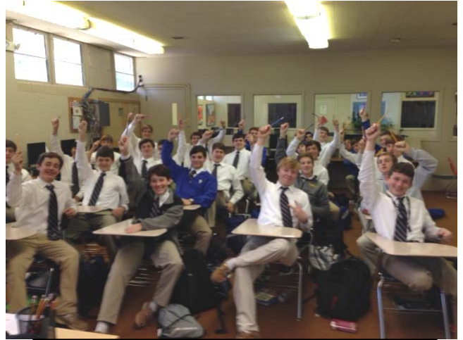
English I H class raise their pencils in honor of National Pencil Day!

2014-15 Scheduling Sessions: This week, current 8 th and 9 th graders will begin choosing classes for next year. Only students who have completed the registration process (turned in both fee and form) will be allowed to select classes. If your registration is incomplete and you plan on your son attending next year, please send payment and registration form on Monday morning. Thanks. Direct any questions to me. Current 10 th & 11 th grade students have already received their scheduling packets and should return them to the counseling office this week. PLEASE TAKE THIS SERIOUSLY. We make hiring and curriculum decisions based upon the scheduling packets.