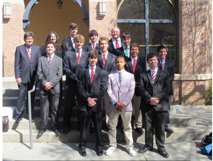
Young Lawyers prepare to leave for mock trial competition.

A PENCIL MAKER TOLD THE PENCIL 5 IMPORTANT LESSONS JUST BEFORE PUTTING IT IN THE BOX: