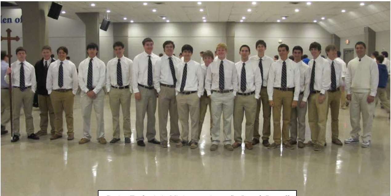
Senior Eucharistic Ministers prior to St. Joseph Day all school mass last week.

SPS Mardi Gras Bead Drive: Instead of throwing old beads out, please donate beads to the SPS bead drive. All beads will be donated to help fund St. Michael's Special School. This is a school that helps kids with disabilities such as autism, cerebral palsy, and Asperger's syndrome. The beads donated will help with color and shape lessons, as well as funding for school.