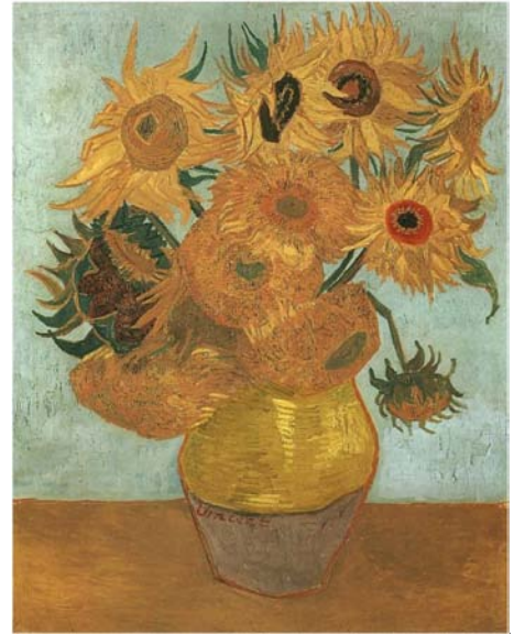
Vincent Van Gogh's "Vase with Twelve Sunflowers"