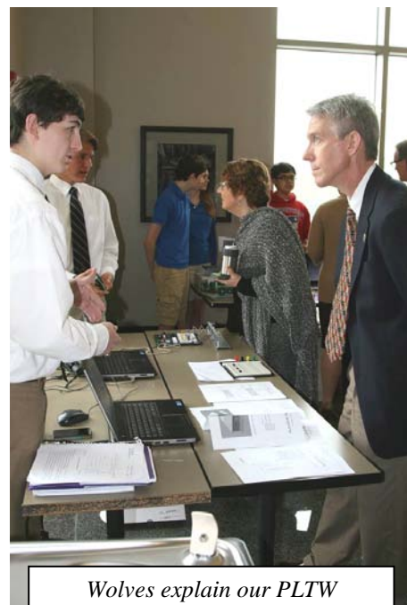
Wolves explain our PLTW programs to the president of SLU!