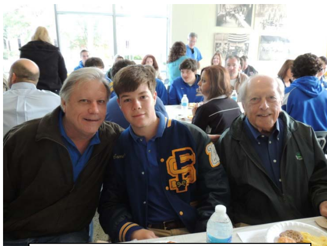
SPS student enjoys HRB with dad & granddad.