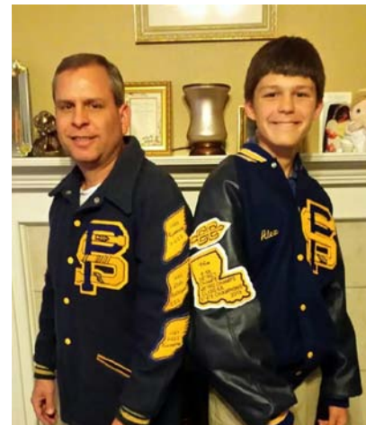
A freshman (r) models his new letter jacket as his 1988 SPS alum dad models his!

I'm Still Begging: Thanks to those who each week to my request. But PLEASE – I need everyone's help, including alumni and grandparents. For clarity, I offer the following: