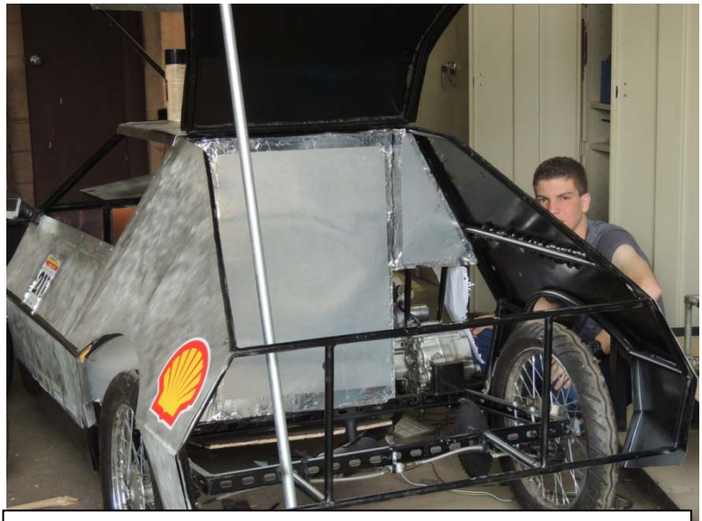
One of SIX eco-cars being built by Wolves on Wheels in preparation for competition in Shell Marathon at end of April.