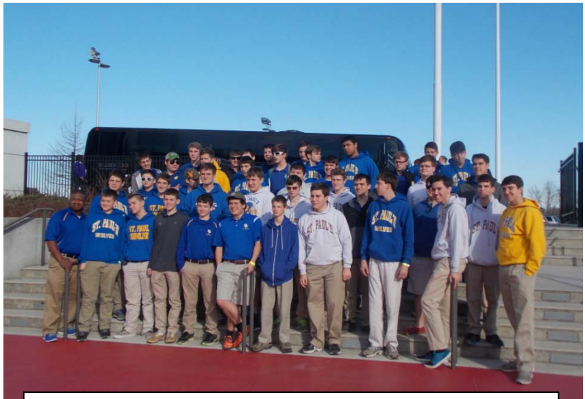
LA 41 st AFJROTC at recent field trip to Huntsville Space Center and Six Flags Over Atlanta

April 8 – President’s Assembly April 9 – Leadership Breakfast April 10 – Guest Speaker April 11 – Assembly – SC Elections April 14 – Late Start for Faculty Meeting/Challenge Night April 15 – Pack Time April 17 – Easter Holidays ( NOT SPRING BREAK ) begin at 3:00 April 29 – President’s Assembly May 2 – Sophomore Service Day May 6 – Pack Time May 7-9 – Senior Exams May 12 - Athletic Awards May 13 – President’s Assembly May 13 -- Band Awards in PM May 14-16 – Pre Freshmen Exams May 14 – Grad Night May 15 – Level Awards iassembly May 16 – Major Awards in AM assembly (dress uniform day) May 18 – Senior Graduation May 19 – Pre Freshmen Promotion/ Exam Schedule Begins May 23 – Exam conflict and make up day