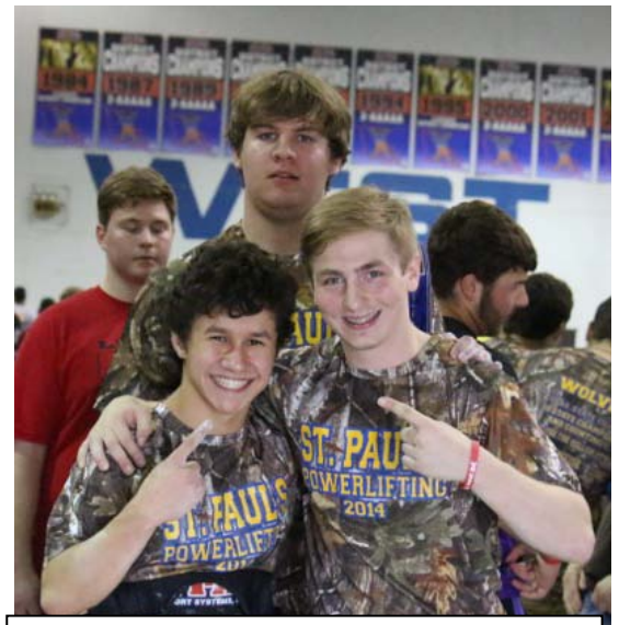
Three Wolves win State Championships at Power Lifting Meet!