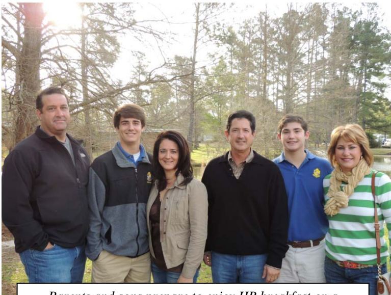
Parents and sons prepare to enjoy HR breakfast on a beautiful SPS morning!