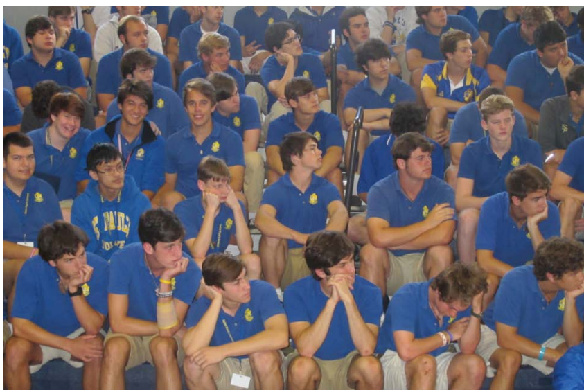
Seniors at their last President's Assembly last week