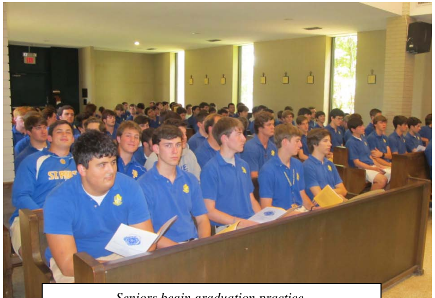
Seniors begin graduation practice.

Bookstore Clearance Sale: On Fri, May 15 th the Mothers Club is opening the bookstore for the entire day to have an End of School sale. We have also invited all boosters clubs to bring their left over spirit items to sell as well. We will be having sale from 9am - 4pm in the courtyard between the Briggs Center and LaSalle Hall. We are trying to make an effort to have some uniformity with all booster sales together so that parents can get as much SPS apparel as they want at one time. We will also be selling used uniforms