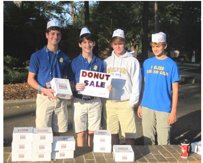
Lasallian Young Leaders sell donuts last week to help fund their trip to Lasallian Student Leaders program this summer in CA.