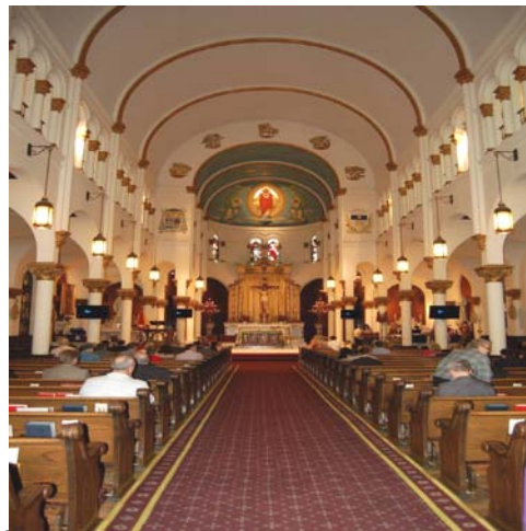
Inside of 150 yr old Basilica. Note TV screens. Archbishop Wilton Gregory of Atlanta gave his pastoral address to us!