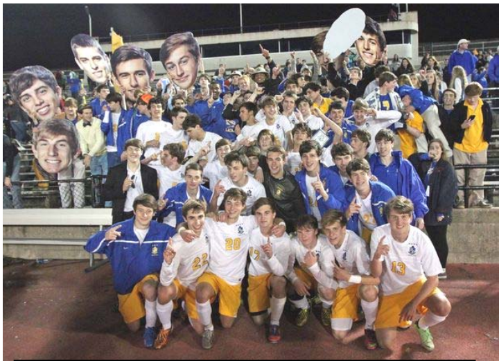
Can't see this pic too many times! We are proud of you, State Champion Soccer Wolves!