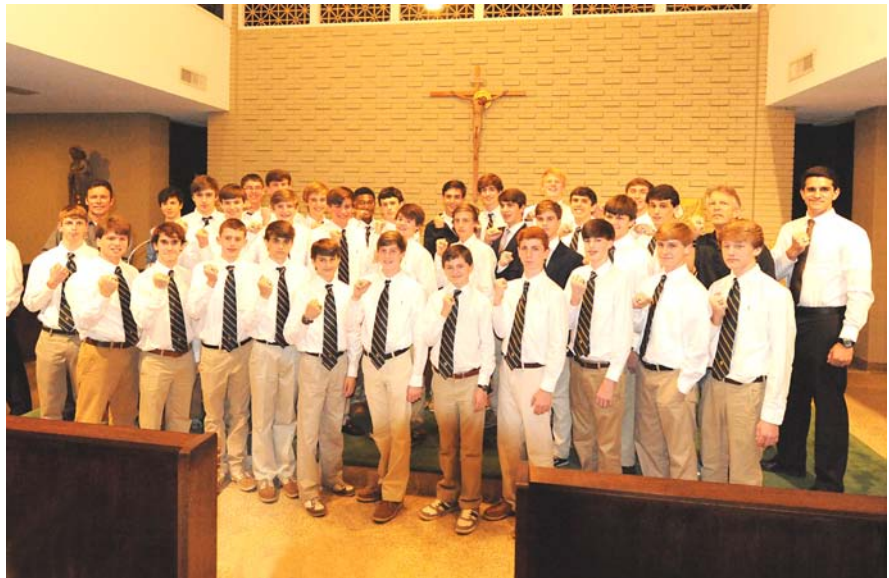
Lots of bling as the Cross Country Team received state championship rings at a chapel prayer service recently.