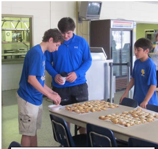
Wolves ice and sprinkle freshly baked cookies for St. Joseph Altar on Feb 22.