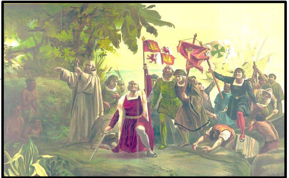
First landing of Columbus on the shores of the New World, at San Salvador, W.I., Oct. 12th 1492 , Dióscoro Teófilo Puebla Tolín