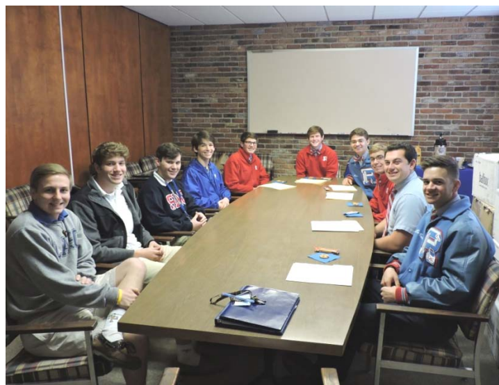
SPS Lasallian Young Leaders conference with LYLs from Rummel last week