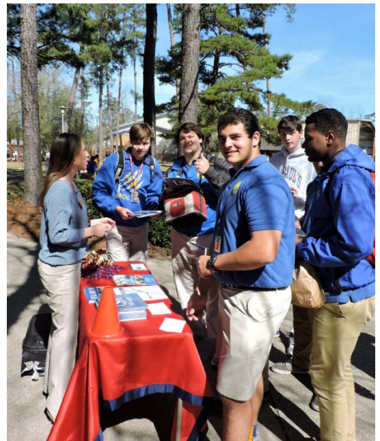
Wolves explore college options on campus last week by visiting with a representative from Unv of South Alabama.