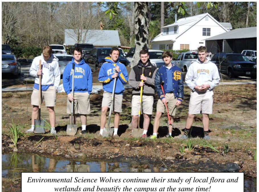
Environmental Science Wolves continue their study of local flora and wetlands and beautify the campus at the same time!

2016 Summer at Camp Abbey Seeking Staff: Camp Abbey, a ministry of the CYO/Youth & Young Adult Ministry Office of the Archdiocese of New Orleans, has begun preparations for its 2015 summer program and is seeking high school student applicants for junior counselor positions and graduating seniors, college students, and older for senior counselor and administrative positions. Although all positions are paid,