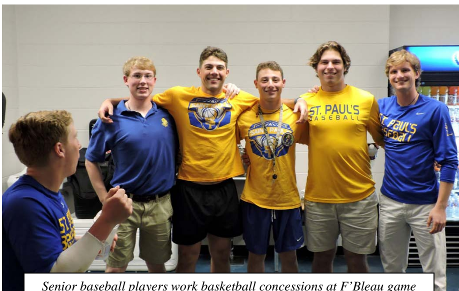
Senior baseball players work basketball concessions at F'Bleau game last week.