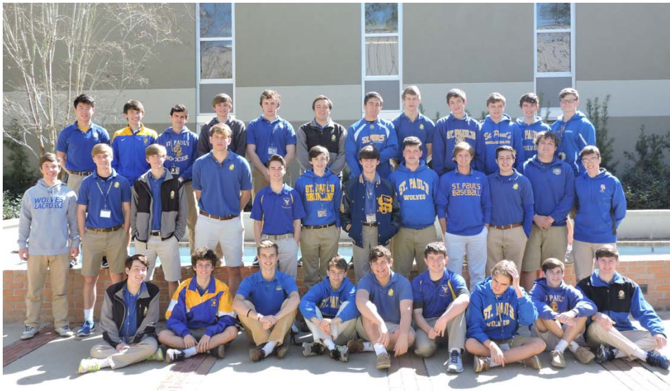
Just some of our ACT 30+ students who enjoyed a special pizza lunch last week courtesy of the SPS Renaissance Board to reward their academic accomplishment.

Haircuts and Grooming: Our guys are taking advantage of the cold and are looking scraggly. My patience, though, is wearing thin. I want all students, including SENIORS, to be in full compliance – or suffer the consequences. I remind all that the handbook parents and students signed at the beginning of the year states that the school is the final determiner of what hair style is in compliance with our rules. As I told one student recently, SPS has the most liberal dress code of all the Catholic all boy high schools in the archdiocese – but even we have limits. Thanks for the support.