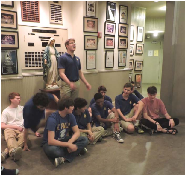
Marian Players rehearse for "Joseph and the Amazing Technicolor Dream Coat" which opens in a few weeks.