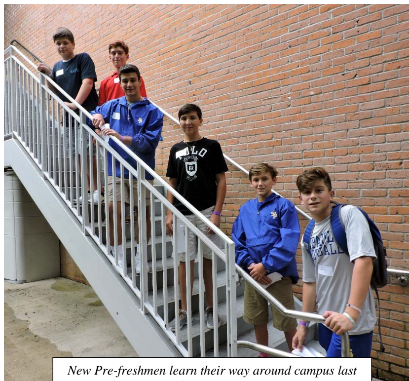
New Pre-freshmen learn their way around campus last week at orientation.