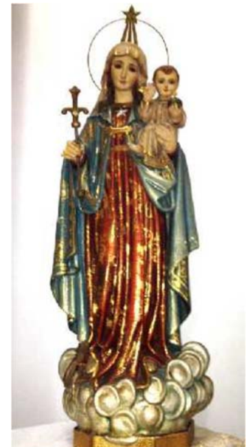
Our Lady of the Star Statue in Brother's Motherhouse in Rome

The origin of the Sanctuary of Our Lady of the Star in Montebourg, Normandy, France, is lost in legend. A Benedictine monastery was founded there in the eleventh century and remained throughout the lower Middle Ages one of the four great abbeys of Cotentin. The sanctuary was demolished, along with the monastery, during the time of the French Revolution at the end of the eighteenth century. Both structures were rebuilt by the Brothers of the Christian Schools of Mercy, beginning in 1842. This diocesan community of religious teaching brothers, like the sisters of the same name founded by Saint Mary Magdalene Postel, followed the Rule of the Brothers of the Christian Schools of De La Salle. They chose to be incorporated in 1938 into the Lasallian Institute. Today the Institute supervises the Lasallian schools in Montebourg, and the Association of Friends of the Monastery and Sanctuary acts as the custodian of this ancient Marian shrine. A number of Brothers of the Christian Schools are individual members of this association.