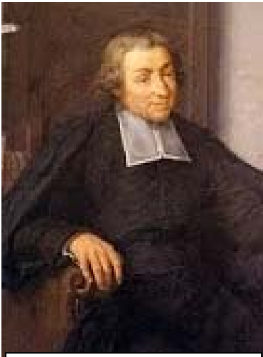
St. John Baptist de La Salle Founder of the Christian Brothers and Patron Saint of Teachers

Once again, welcome to 2017 - 18 school year – the beginning of the seventh year of our second century! I'm glad last week's mammoth newsletter didn't scare you off! I tried to make this one shorter!