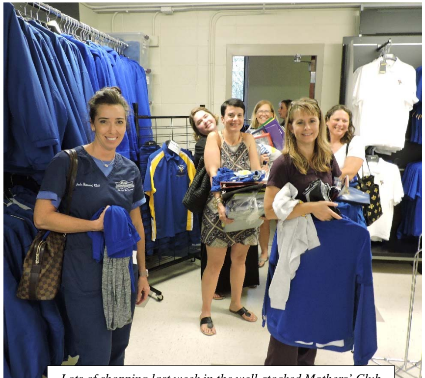
Lots of shopping last week in the well-stocked Mothers' Club Bookstore. Thanks, MC for all you do!

We add our prayers to those of so many others for this good priest – who is a good friend to Saint Paul's School.