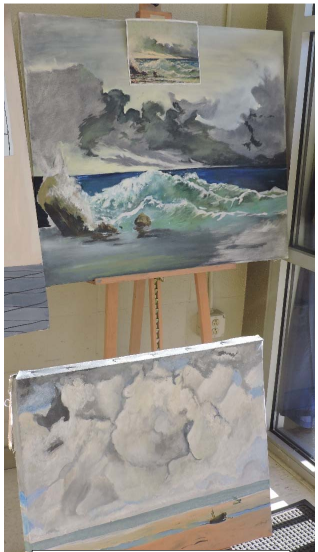
Student artwork awaits finishing touches.