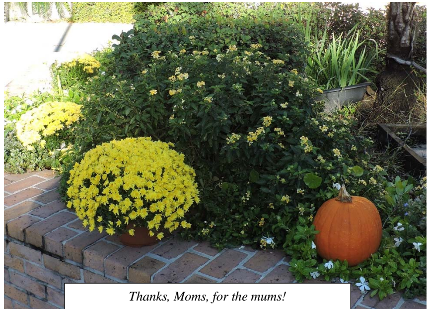
Thanks, Moms, for the mums!