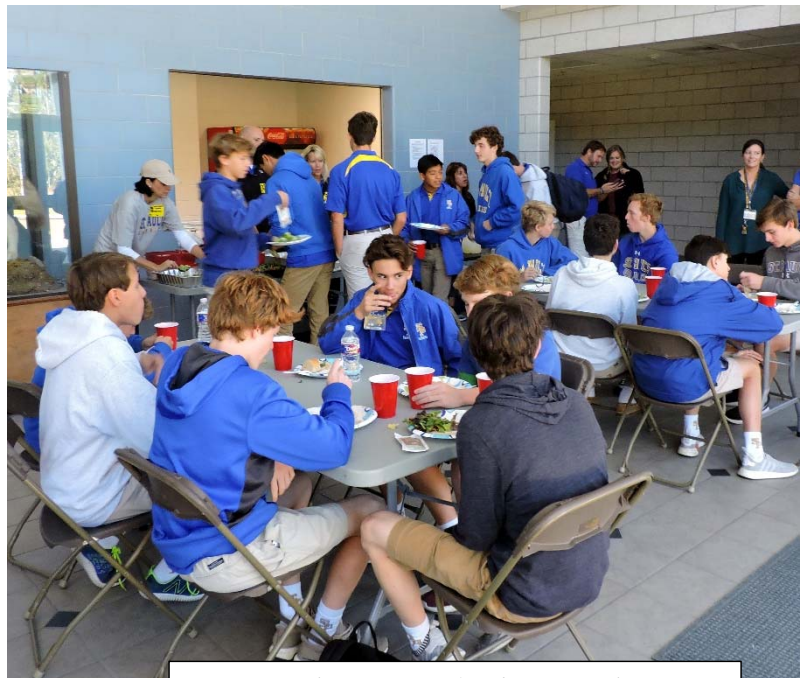
Aqua Wolves prepare for the regional meet – with food, of course!