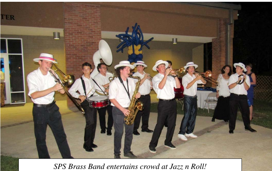
SPS Brass Band entertains crowd at Jazz n Roll! They were GREAT!