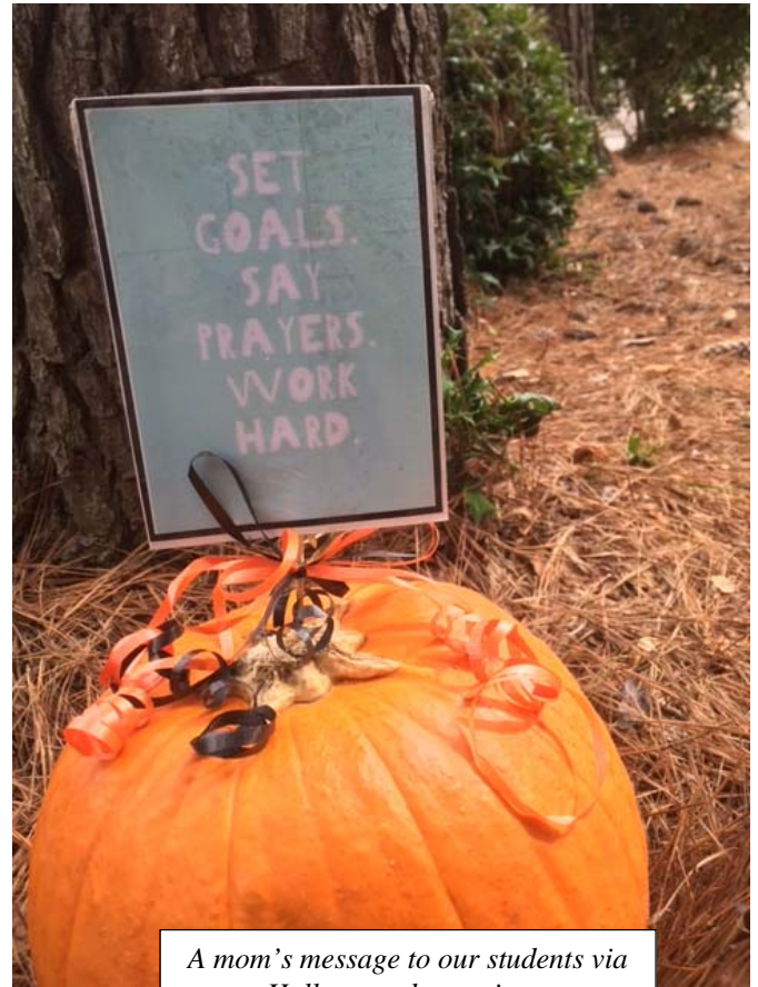
A mom's message to our students via Halloween decorations.