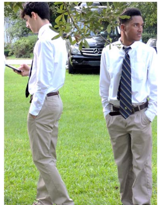
Pensive seniors await start of March through the Arch.