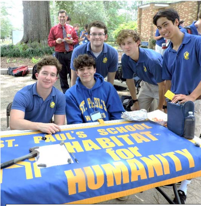
Habitat Wolves recruit new members at Get Involved Day.

Admissions Season for 2019-20: No, this is not a misprint. The admissions process for NEXT year begins on Tuesday with our first Shadow Day – which ! Shadow Days have become very important in causing students to choose SPS as their first choice school. If you know a student interested in SPS next year, encourage him to attend a Shadow Day. Just call the office to sign up.