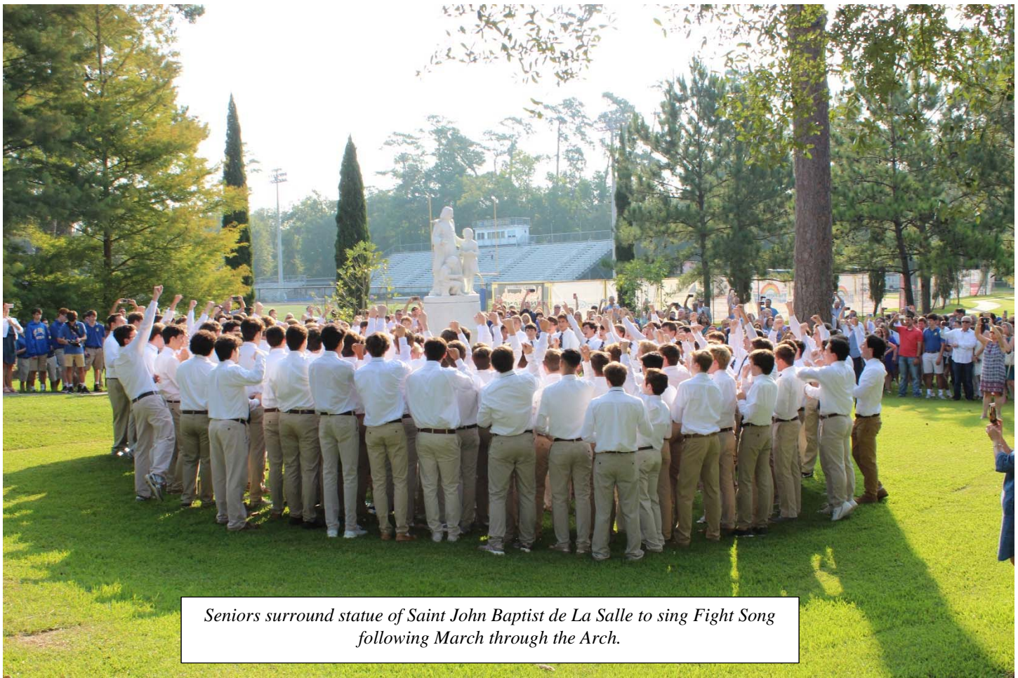
Seniors surround statue of Saint John Baptist de La Salle to sing Fight Song following March through the Arch.