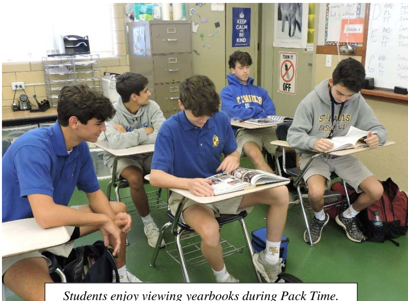
Students enjoy viewing yearbooks during Pack Time.