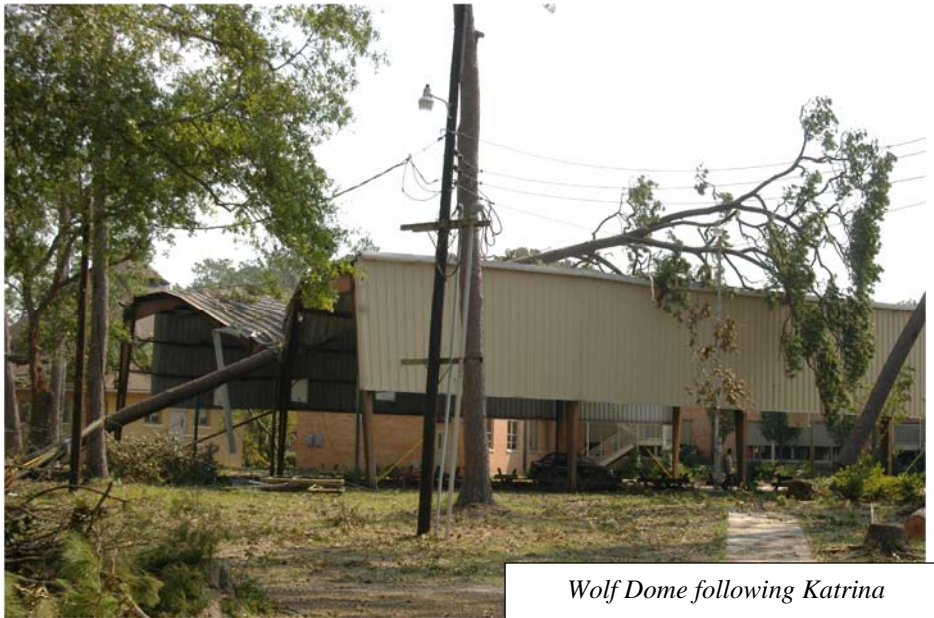
Wolf Dome following Katrina

May Our Lady of Prompt Succor hasten to keep us safe from the ravages of storms!