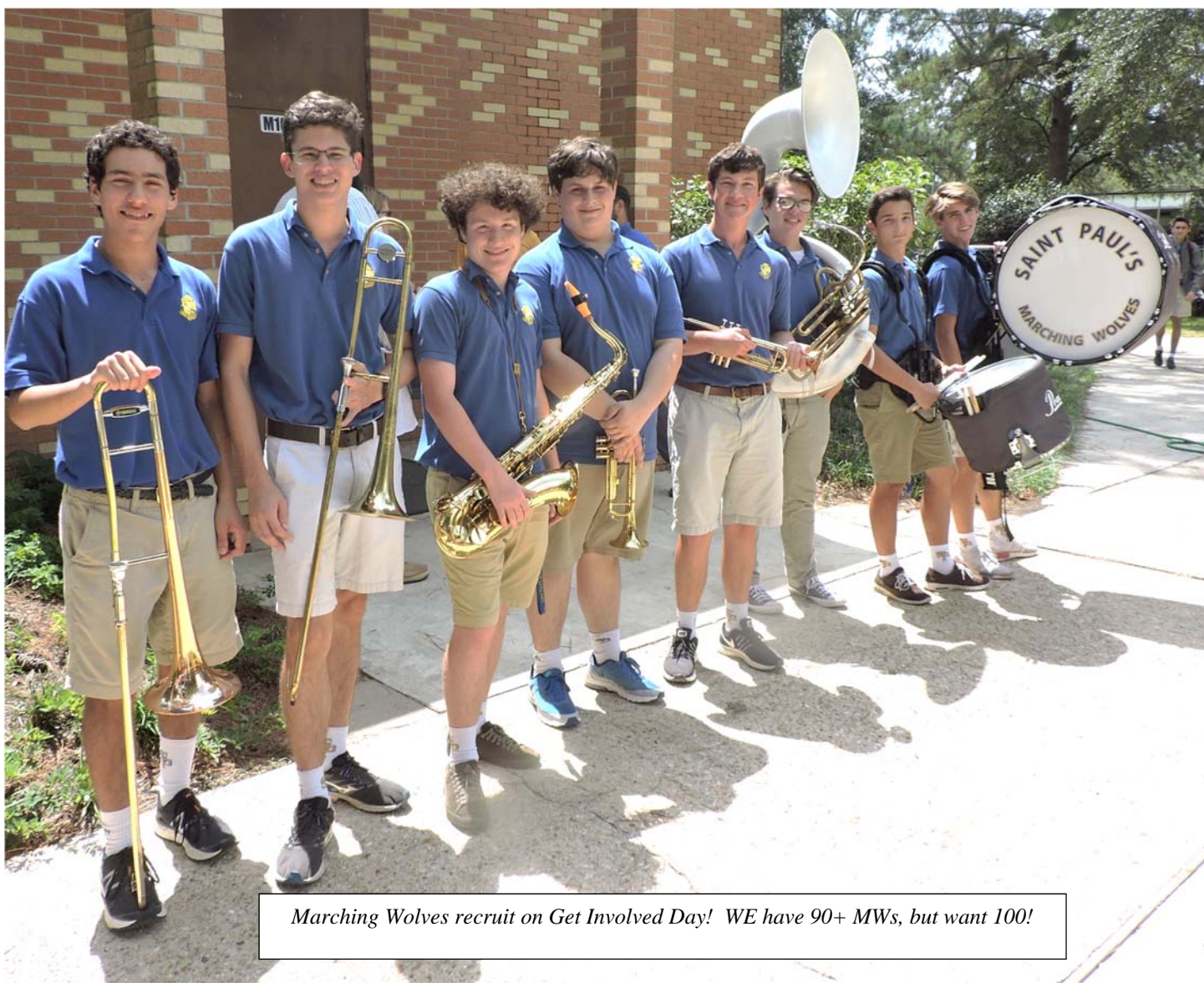
Marching Wolves recruit on Get Involved Day! WE have 90+ MWs, but want 100!

Grandparent Day: Our annual Grandparent Day will take place on Friday, Oct 12, beginning at 11:30 and lasts about 90 minutes. If your son's grandparents are interested, please inform them of the date and time. Thanks!