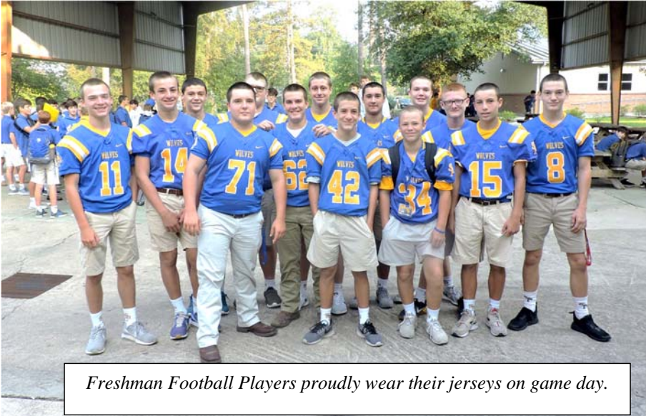
Freshman Football Players proudly wear their jerseys on game day.