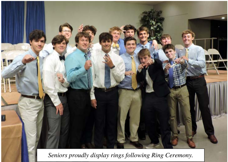
Seniors proudly display rings following Ring Ceremony.