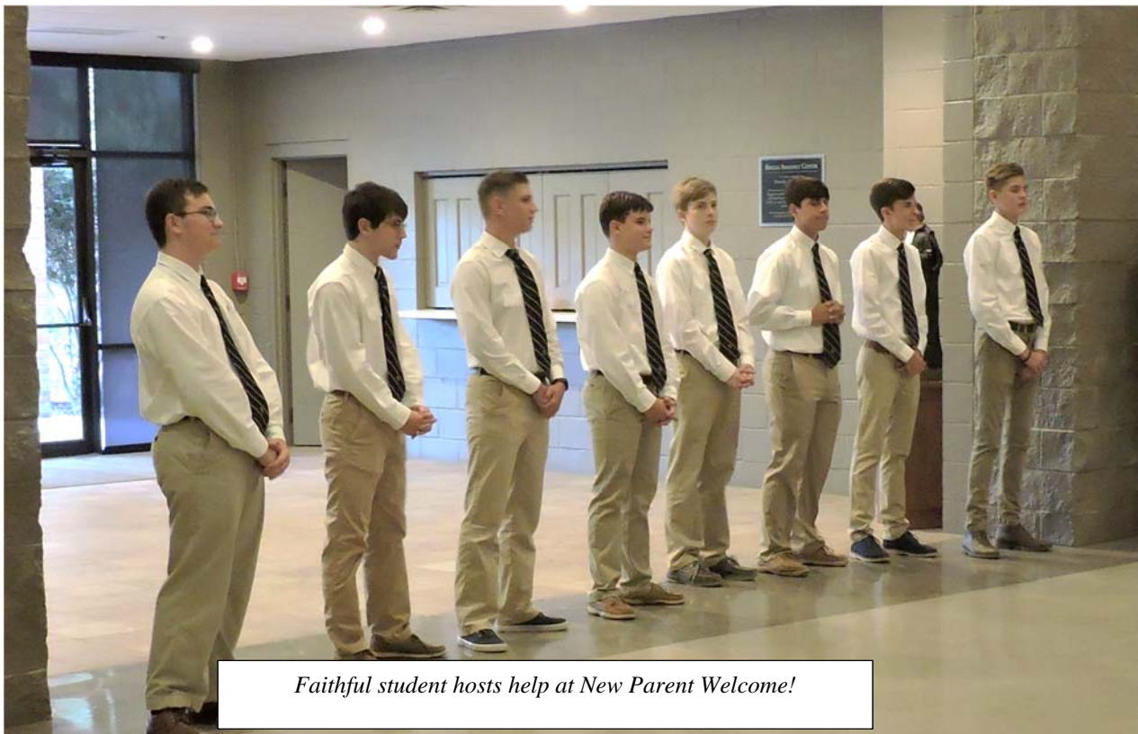
Faithful student hosts help at New Parent Welcome!

Again, we give thanks that the Brothers finally decided to purchase Saint Paul's – although they would eventually open schools in New Iberia and San Antonio, too, but not Mobile or on Indian reservations! Thank you, Founding Brothers!