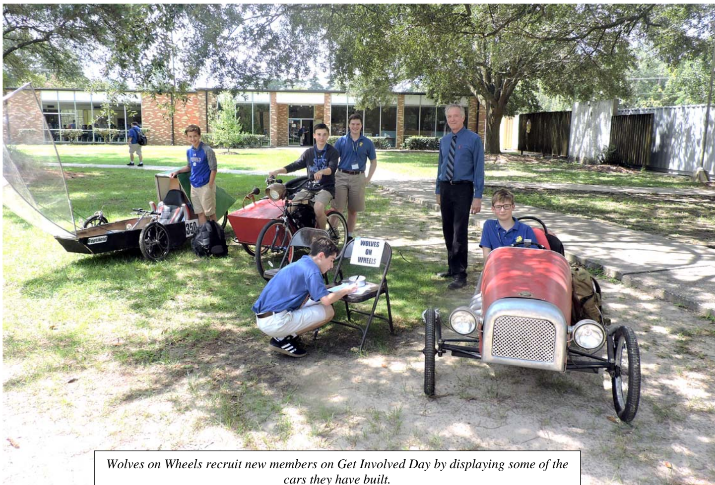
Wolves on Wheels recruit new members on Get Involved Day by displaying some of the cars they have built.

Social Media II: Parents, please speak with your sons about responsible social media use. Inappropriate postings can have legal ramifications. In addition, SPS reserves the right to impose consequences on our students who misuse social media.