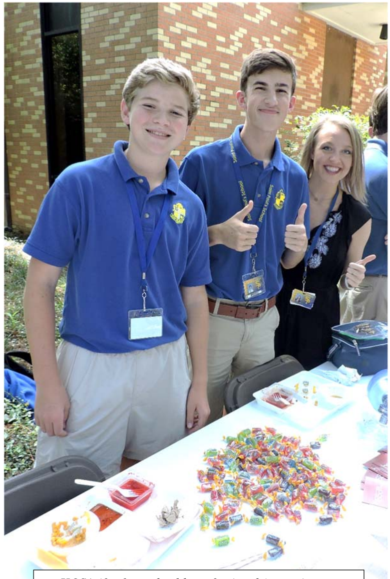
HOSA (for future health professionals) recruits new members at Get Involved Day!

Pray that we continue to have a good beginning! Thanks for being part of Saint Paul’s! May our year be one of grace and blessing! Know of my prayer for you and call on me if I can help!