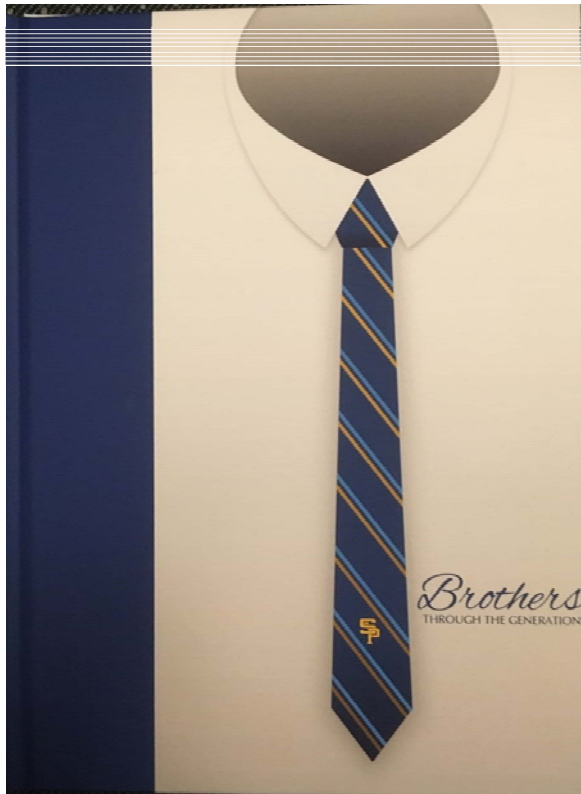
2019 Yearbook (The Conifer). Order yearbook before Mar 14's price increase.

YEARBOOKS for 2019-20 school year are now available.