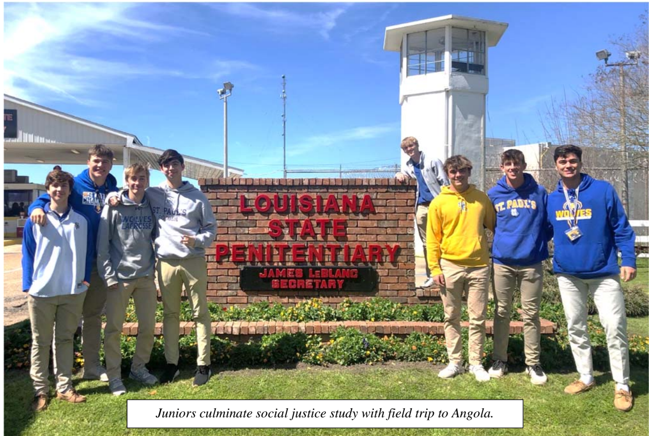
Juniors culminate social justice study with field trip to Angola.