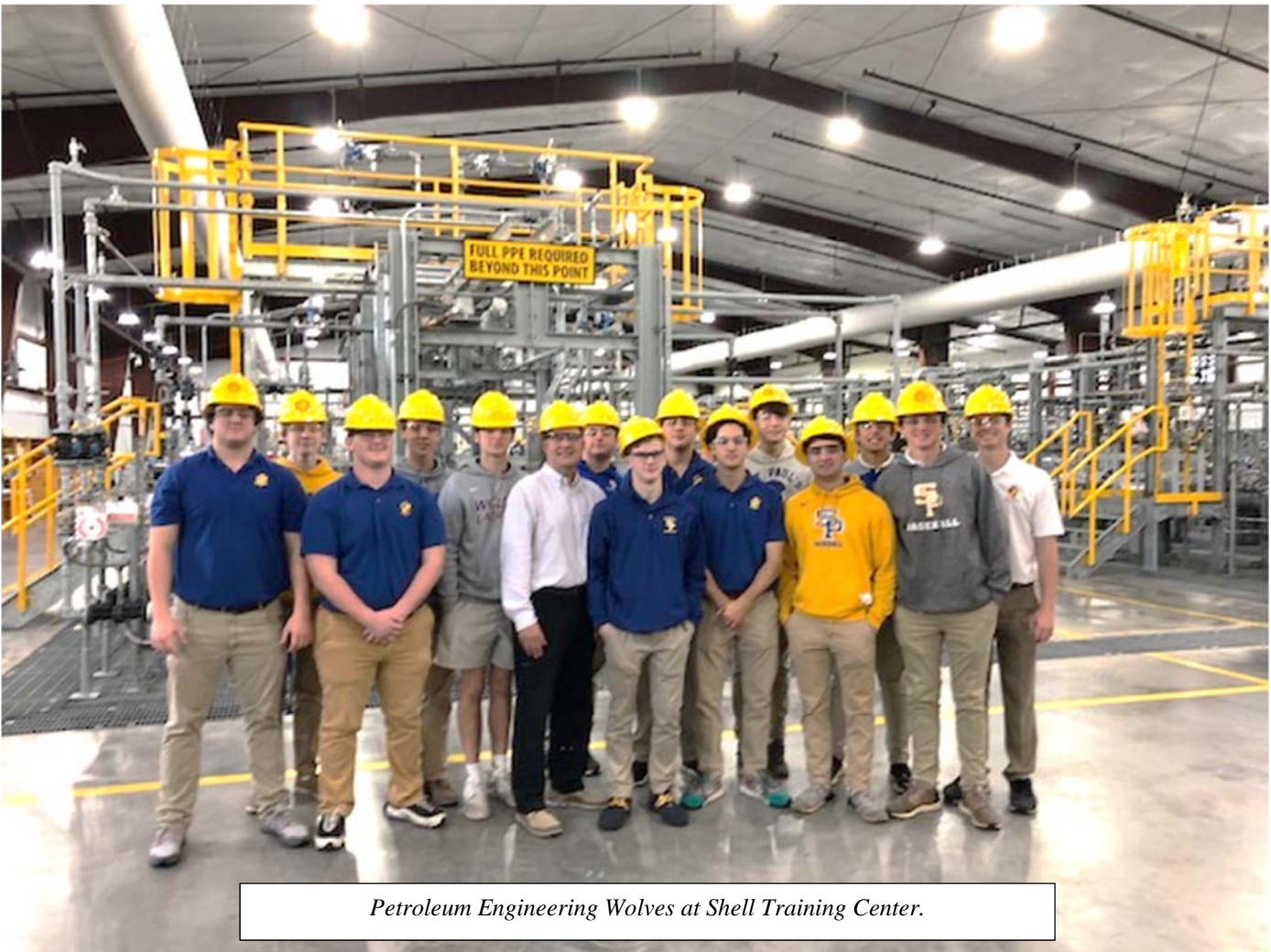
Petroleum Engineering Wolves at Shell Training Center.