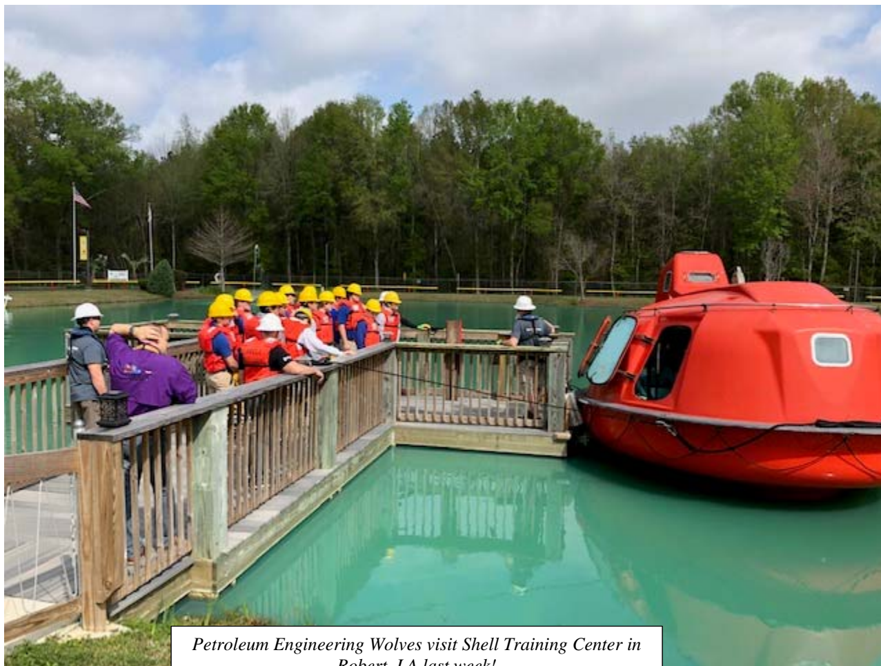
Petroleum Engineering Wolves visit Shell Training Center in Robert, LA last week!