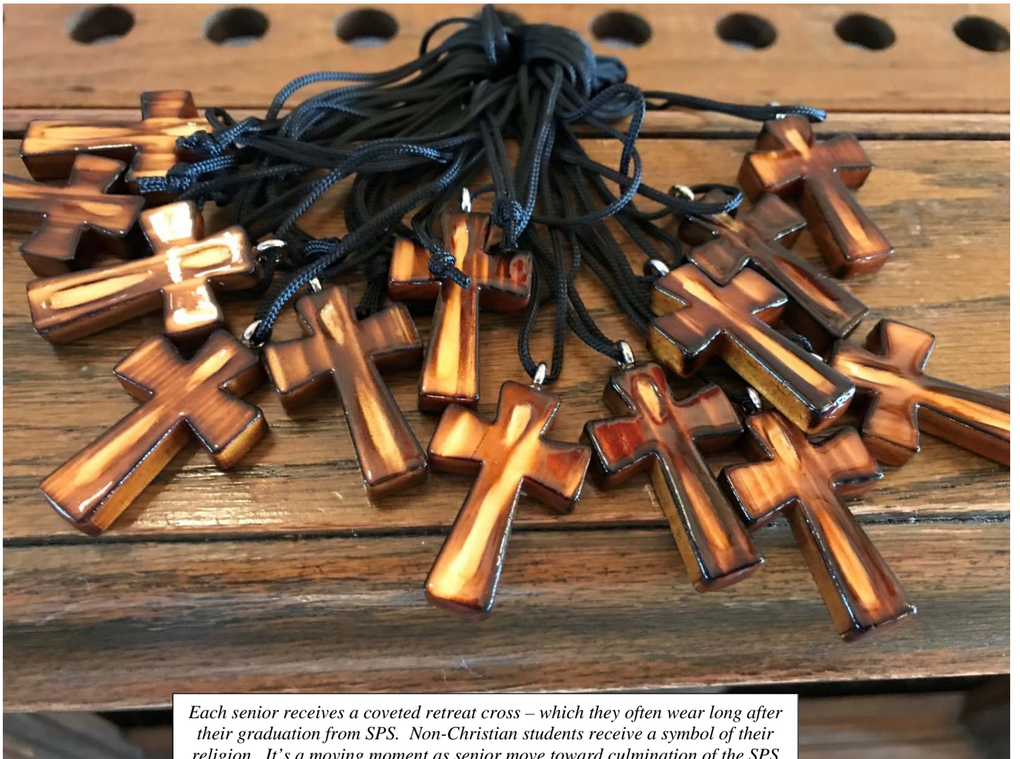
Each senior receives a coveted retreat cross – which they often wear long after their graduation from SPS. Non-Christian students receive a symbol of their religion. It's a moving moment as senior move toward culmination of the SPS careers.