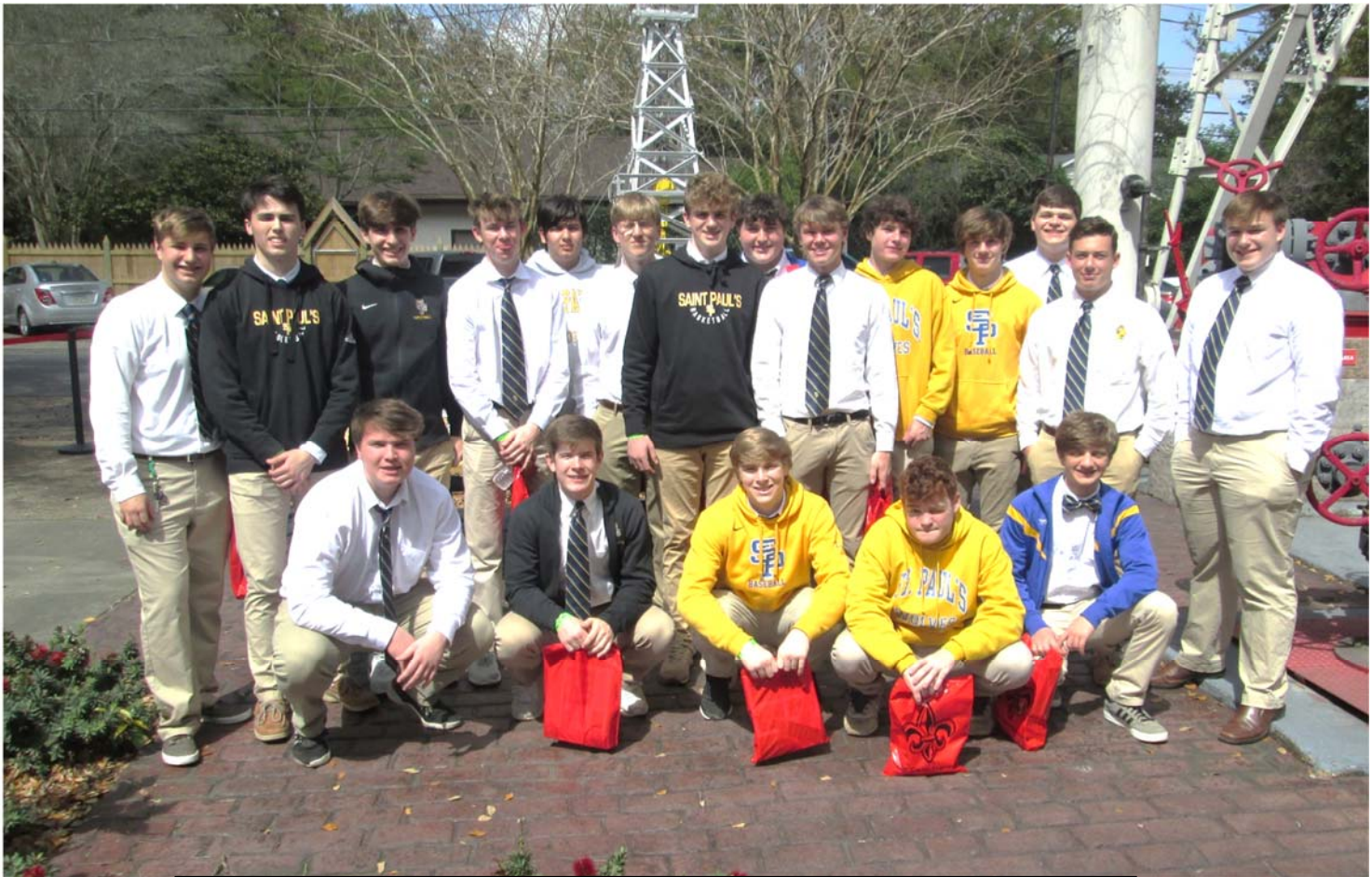
Principles of Engineering Wolves traveled to ULL last week for engineering conference.

GREATER LASALLIAN WORLD: There are 22 schools in the Lasallian District of San Francisco New Orleans. As of Sat afternoon, all but one of our District schools have announced closures/distance learning plans due to the COVID-19. They include De La Salle High School in Concord, CA, Sacred Heart Cathedral in San Francisco, Cathedral High School in Los Angeles, Mullen High School in Denver, De Marillac Academy in San Francisco, Saint Mary's College High School in Berkley, CA, La Salle College Prep in Pasadena, Lasalle Catholic College Prep in Milwaukie, OR, Cristo Rey De La Salle East Bay in Oakland, St. Michael's High School in Santa Fe, NM, Rummel High in Metairie, Christian Brothers School in New Orleans, De La Salle High School in New Orleans and Saint Paul's in Covington among others. We anticipate more will join our number. Saint John Baptist de La Salle! Pray for us!