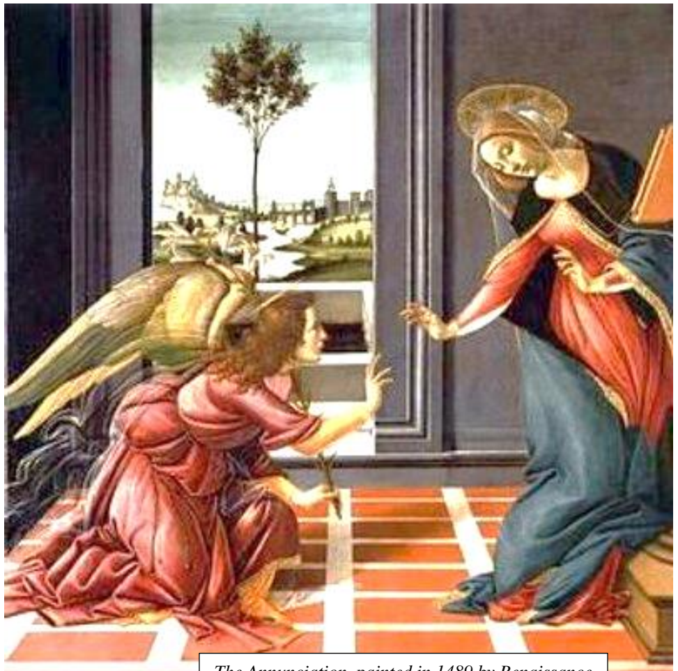
The Annunciation, painted in 1489 by Renaissance painter Sandro Botticelli.