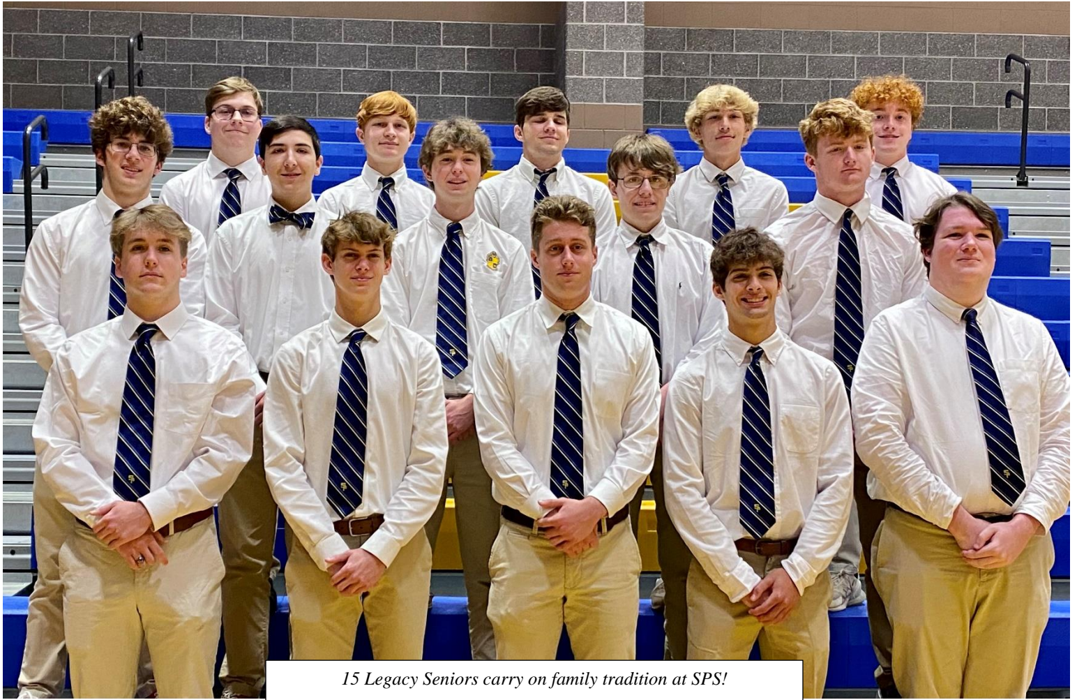
15 Legacy Seniors carry on family tradition at SPS!

STUFF THE BUS: The six Catholic schools of western St. Tammany will again help the Northshore Food Bank stock up for the summer with our annual Stuff the Bus. Please encourage your son to bring ravioli – the item assigned to SPS. The drive ends on Apr 1 when AP Joe Dickens will drive one of our busses to the other Catholic schools for “stuffing” and then to the food bank for delivery.