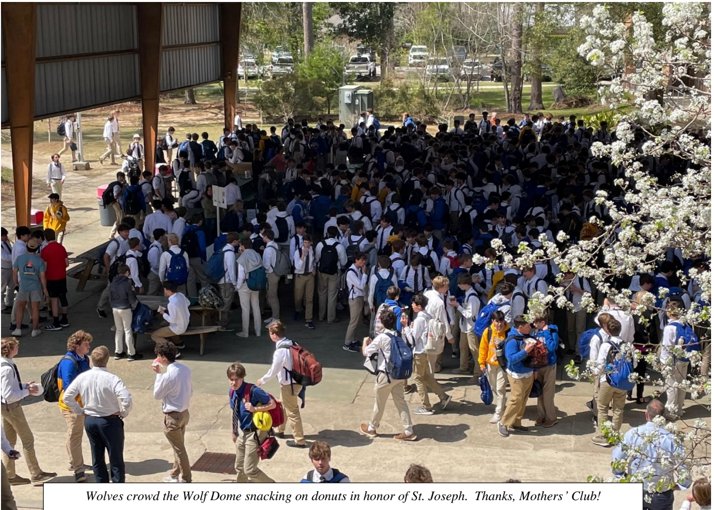
Wolves crowd the Wolf Dome snacking on donuts in honor of St. Joseph. Thanks, Mothers' Club!