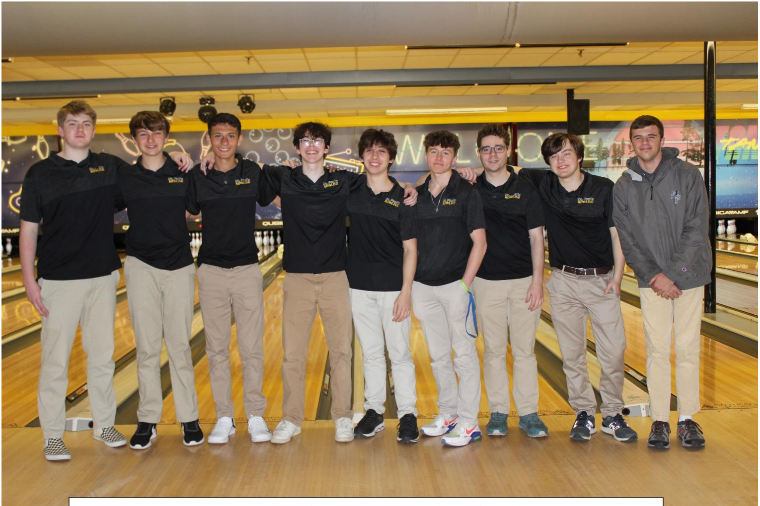
Geaux Bowling Wolves as you enter state playoffs this week!