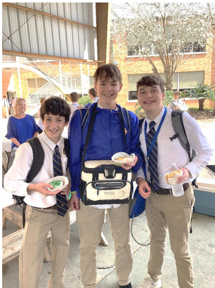
Snacks are guaranteed to bring smiles to Wolves. Thanks, Mothers' Club!