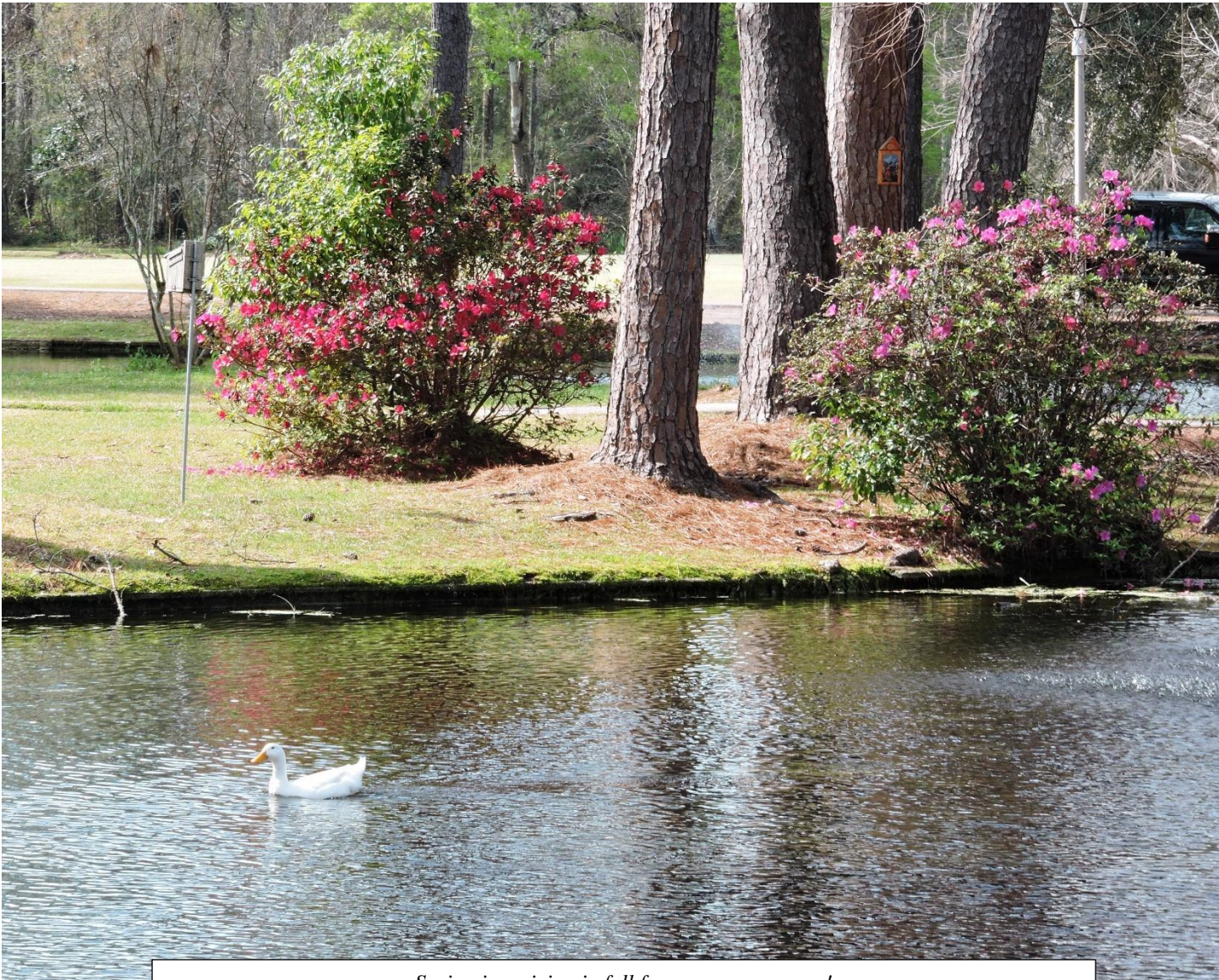
Spring is arriving in full force on our campus!