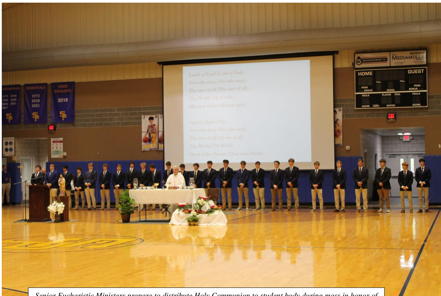
Senior Eucharistic Ministers prepare to distribute Holy Communion to student body during mass in honor of St. Joseph on Friday. The blessed fava beans and prayer cards are in front of the altar.

.... by doing ordinary things extraordinarily well, making courageous choices, doing God's will, remaining faithful, being guided to God, continuing our Lasallian Mission, living courageously, respecting all people, and living the Gospel! Let's give it our best this week as befits a Lasallian Catholic National Blue-Ribbon School.