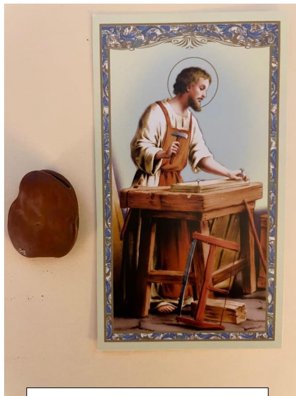
In addition to donuts, boys received fava beans and St. Joseph prayer cards.