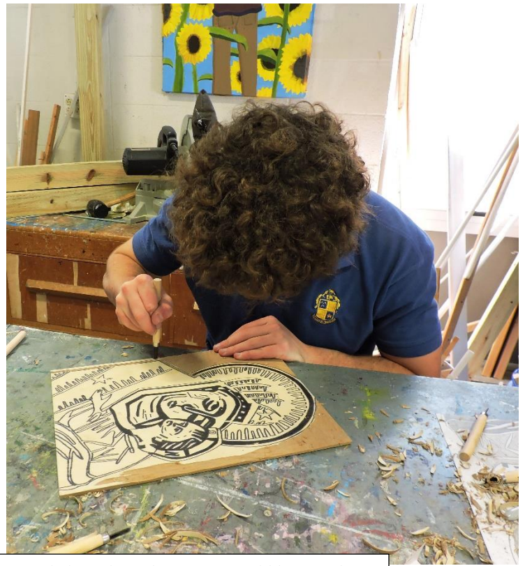
Art Wolves intensely work on their latest creations! Michelangelo and DaVinci would be proud!