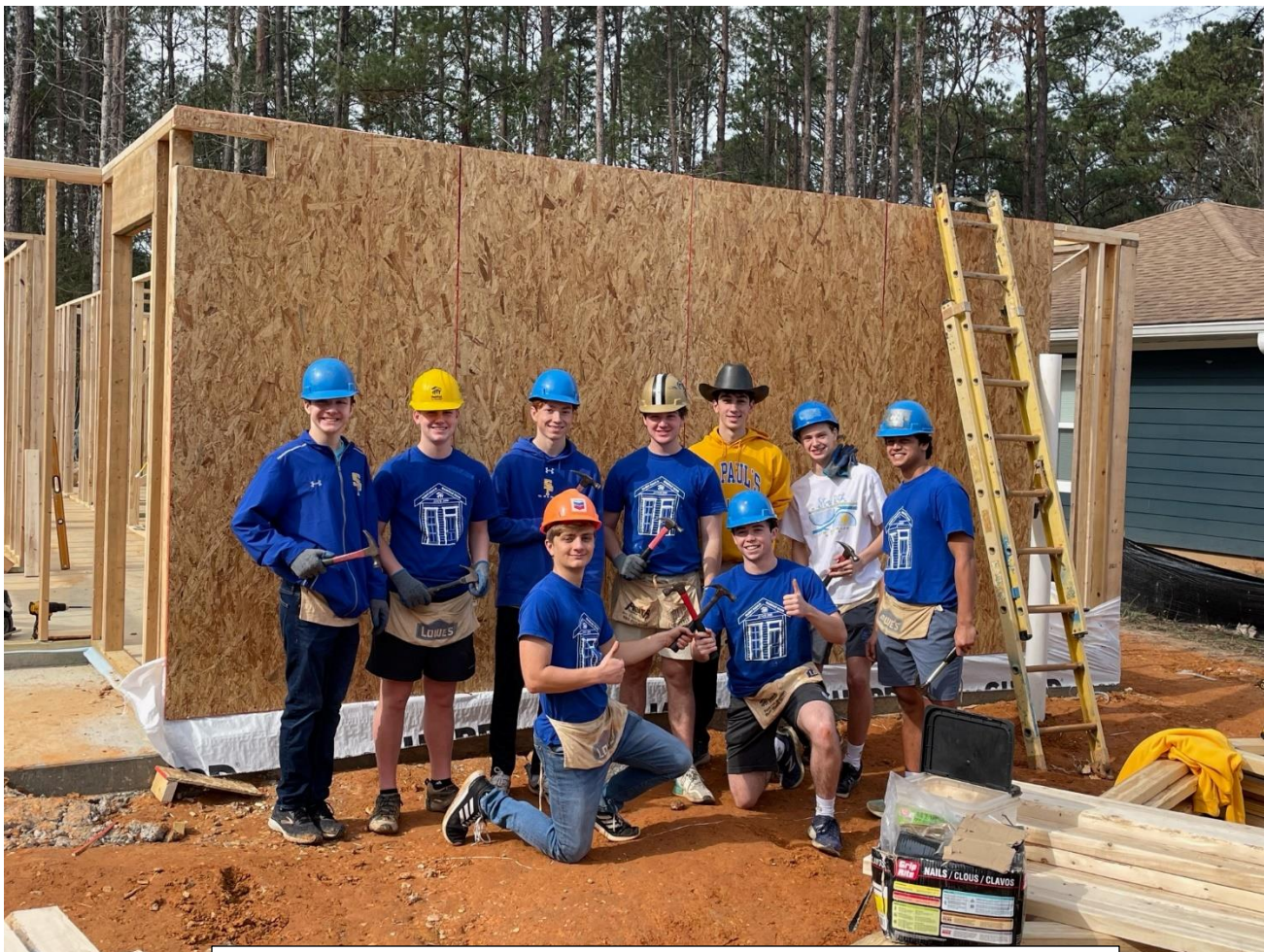
Habitat Wolves on job site.