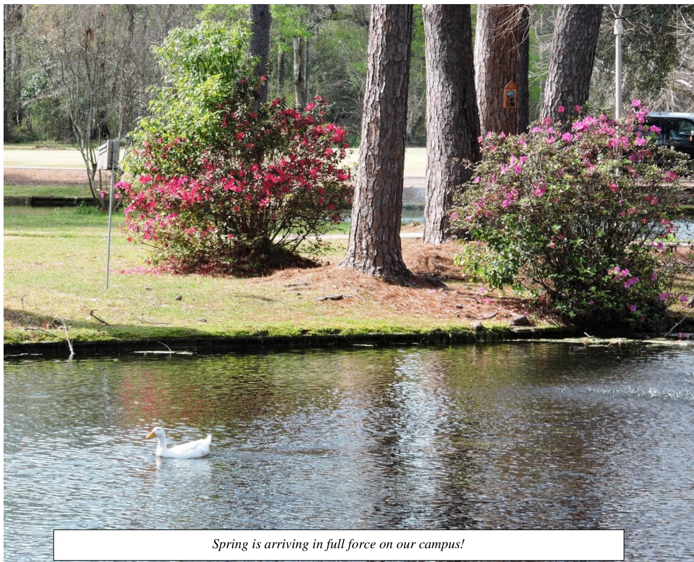
Spring is arriving in full force on our campus!

.... by doing ordinary things extraordinarily well, making courageous choices, doing God's will, remaining faithful, being guided to God, continuing our Lasallian Mission, living courageously, respecting all people, and living the Gospel! Let's give it our best this week as befits a Lasallian Catholic National Blue-Ribbon School.