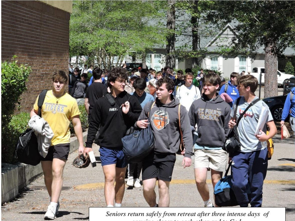
Seniors return safely from retreat after three intense days of growing closer to each other and to God.