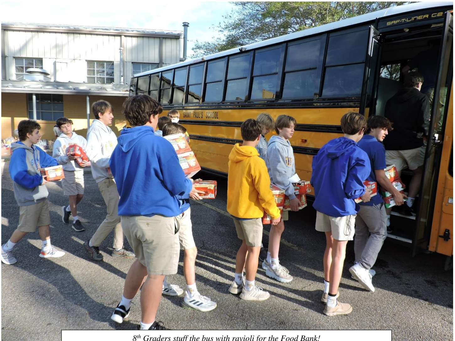
8 th Graders stuff the bus with ravioli for the Food Bank!

TUITION INVOICES: Tuition invoices for 2022-23 have been emailed. Many thanks to those who are already responding. Allow me to express the following: