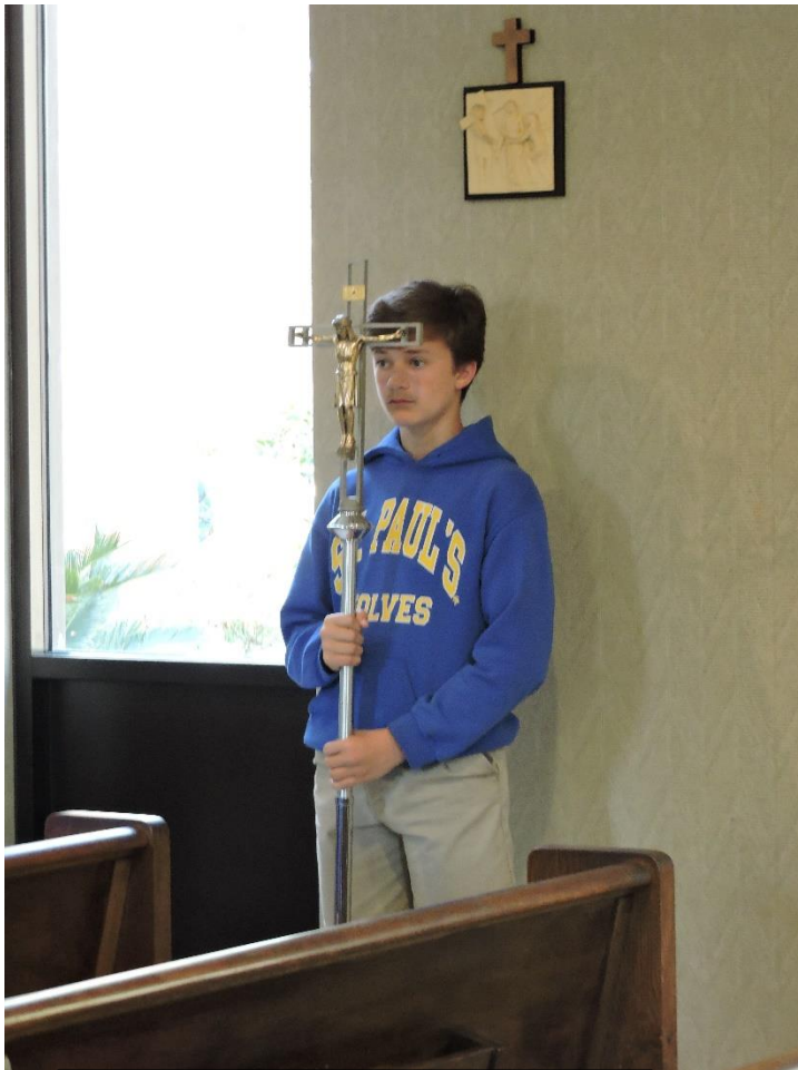
Religion classes pray Stations of the Cross.