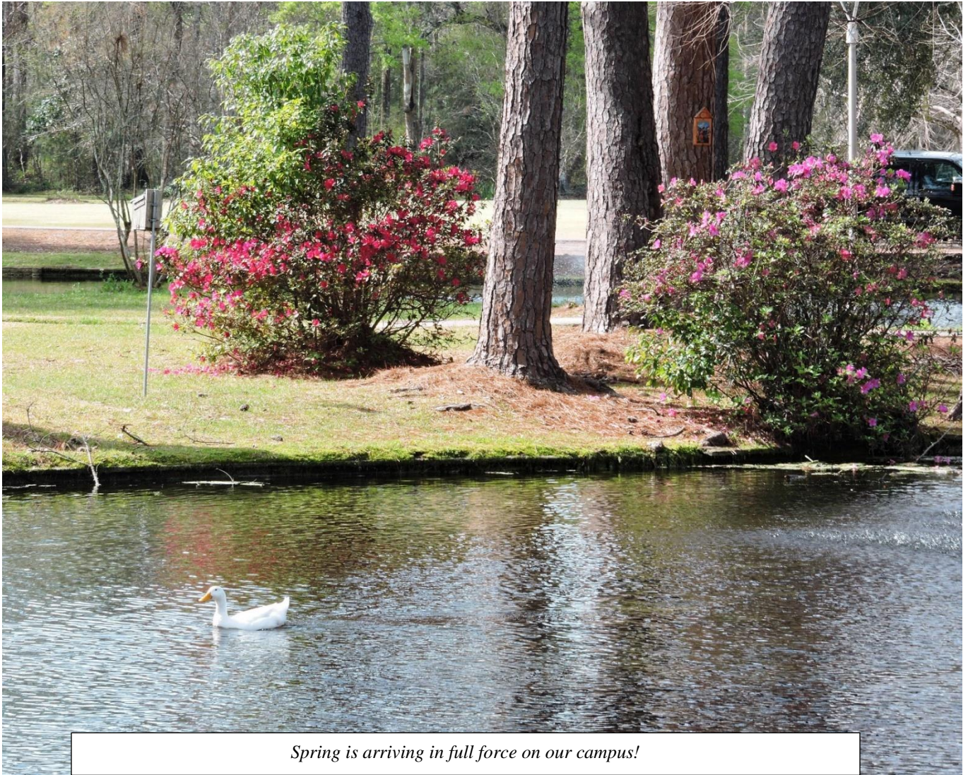
Spring is arriving in full force on our campus!