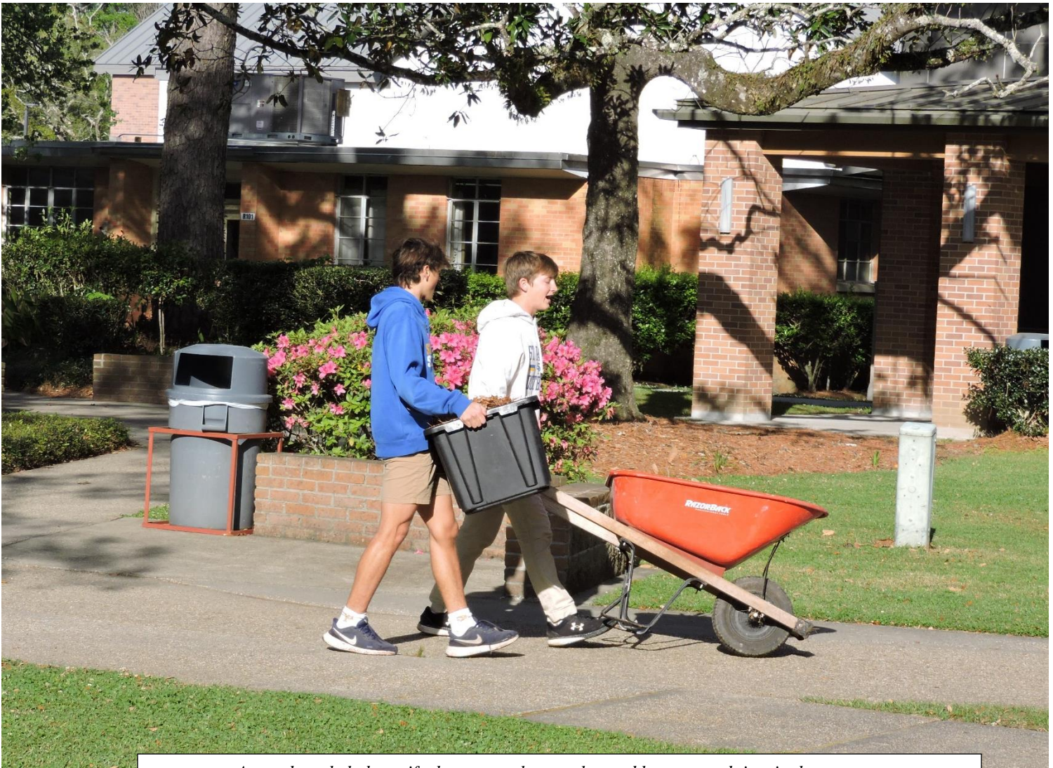
Ag students help beautify the campus last week – and have a good time in the process.