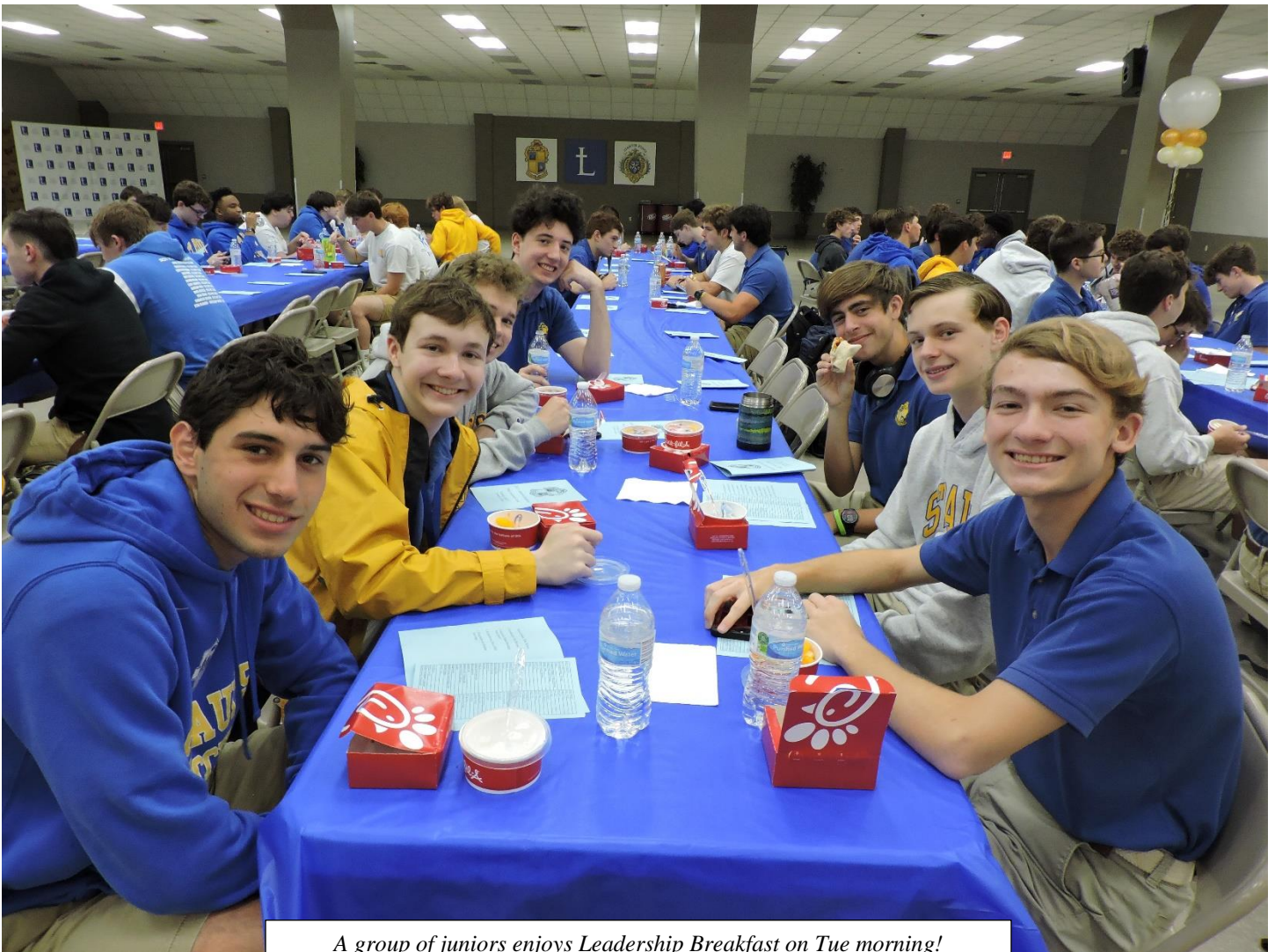
A group of juniors enjoys Leadership Breakfast on Tue morning!

SENIOR GRADUATION: We intend to return to pre-COVID protocols and issue each senior eight (8) tickets for the graduation ceremony on May 14 at 4 pm in the BAC. This assumes no capacity limitation will be placed by civil authorities on indoor gatherings. Do not request more tickets as there is no more room in the BAC.