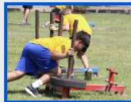
July 11-15: Speed, Agility, Strength