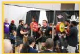
June 27-July 1: Powerlifting/Strength