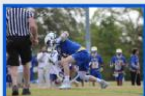
July 18-22 - Lacrosse