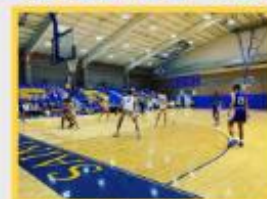
June 20-24: Basketball