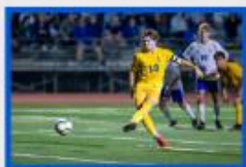
June 27-July 1: Soccer