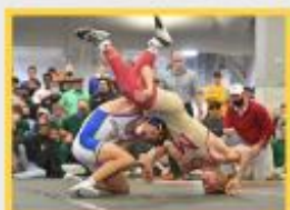
July 18-22 - Wrestling