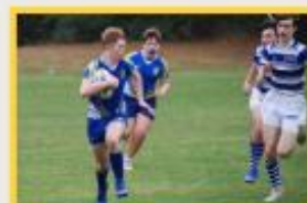
July 18-22 - Rugby