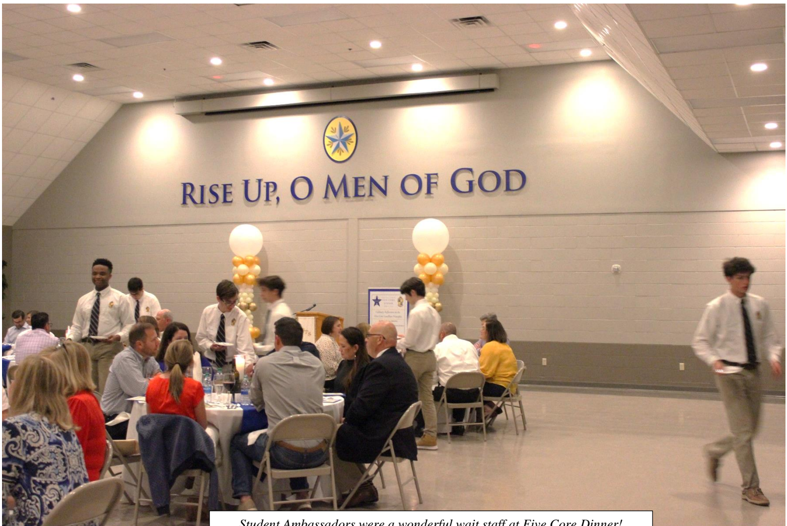
Student Ambassadors were a wonderful wait staff at Five Core Dinner!