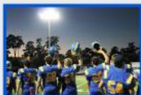
June 13-17: Football