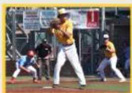
June 6-10: Baseball