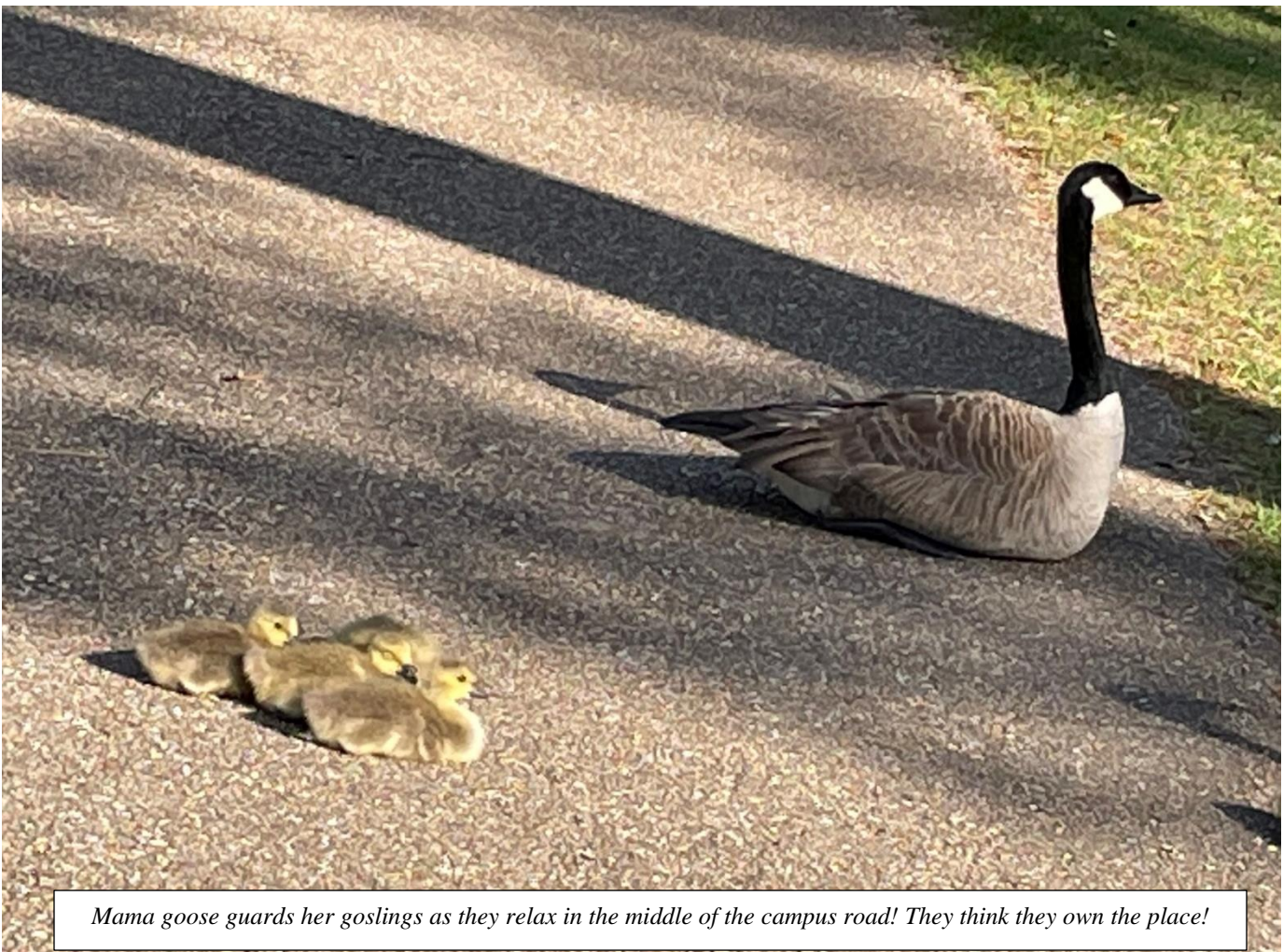
Mama goose guards her goslings as they relax in the middle of the campus road! They think they own the place!