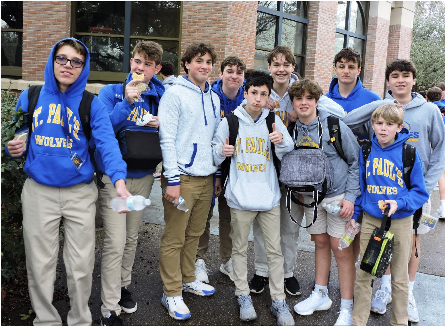
Pre-freshmen smile after MC Snack Day!