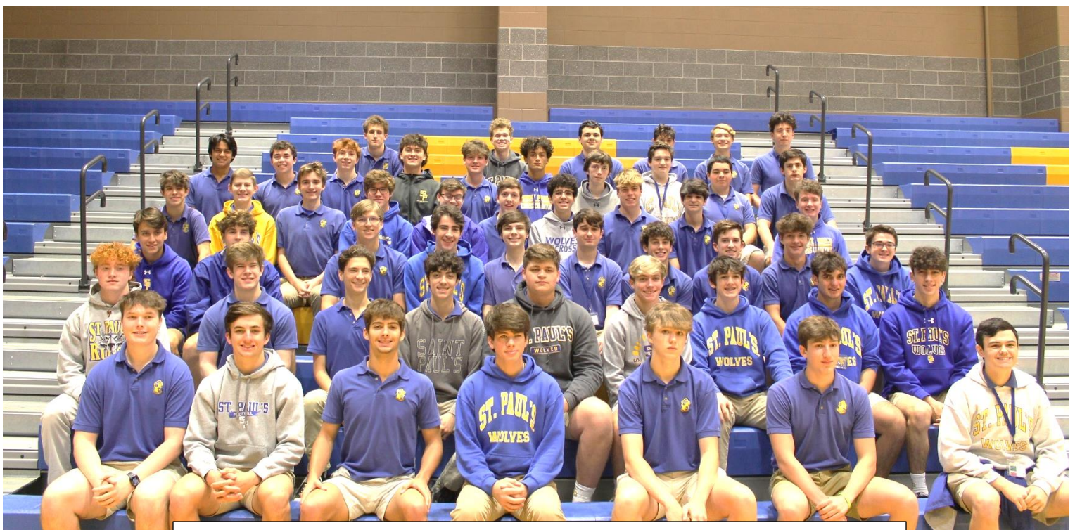
ACT 30+ Club prepares for its celebratory pizza lunch!

SENIOR RINGS FOR CLASS OF 2023: Juniors have received information about class rings. Ordering a ring is strictly optional, and students may always use rings from their SPS brothers or dads. While some rings are quite pricey, reasonably priced ones are available. Josten’s is our official vendor. The Jostens representative will be on campus on 4/27 for ordering