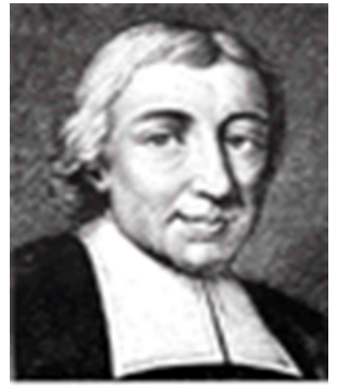
and a strange of the second

Oh! What glory there will be for those persons who have instructed youth, when their zeal and devotion to procure the salvation of children will be made public before all people! All heaven will resound with thanksgiving! Act, then, in such a way by your good and wise guidance of those who are entrusted to you, that you will procure all these blessings and all this glory for yourself!