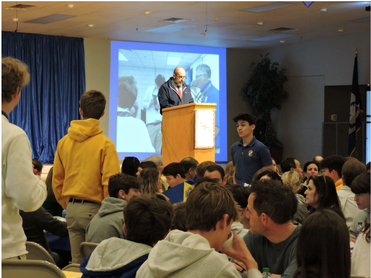
Students are acknowledged for achievement during a recent honor roll breakfast