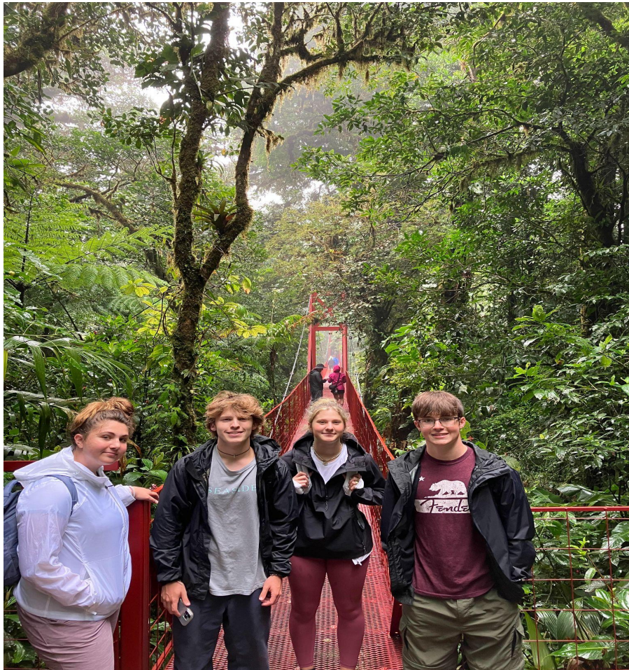
Students from SPS and SSA enjoy a trip through the Costa Rican rain forests last summer during the exchange program.