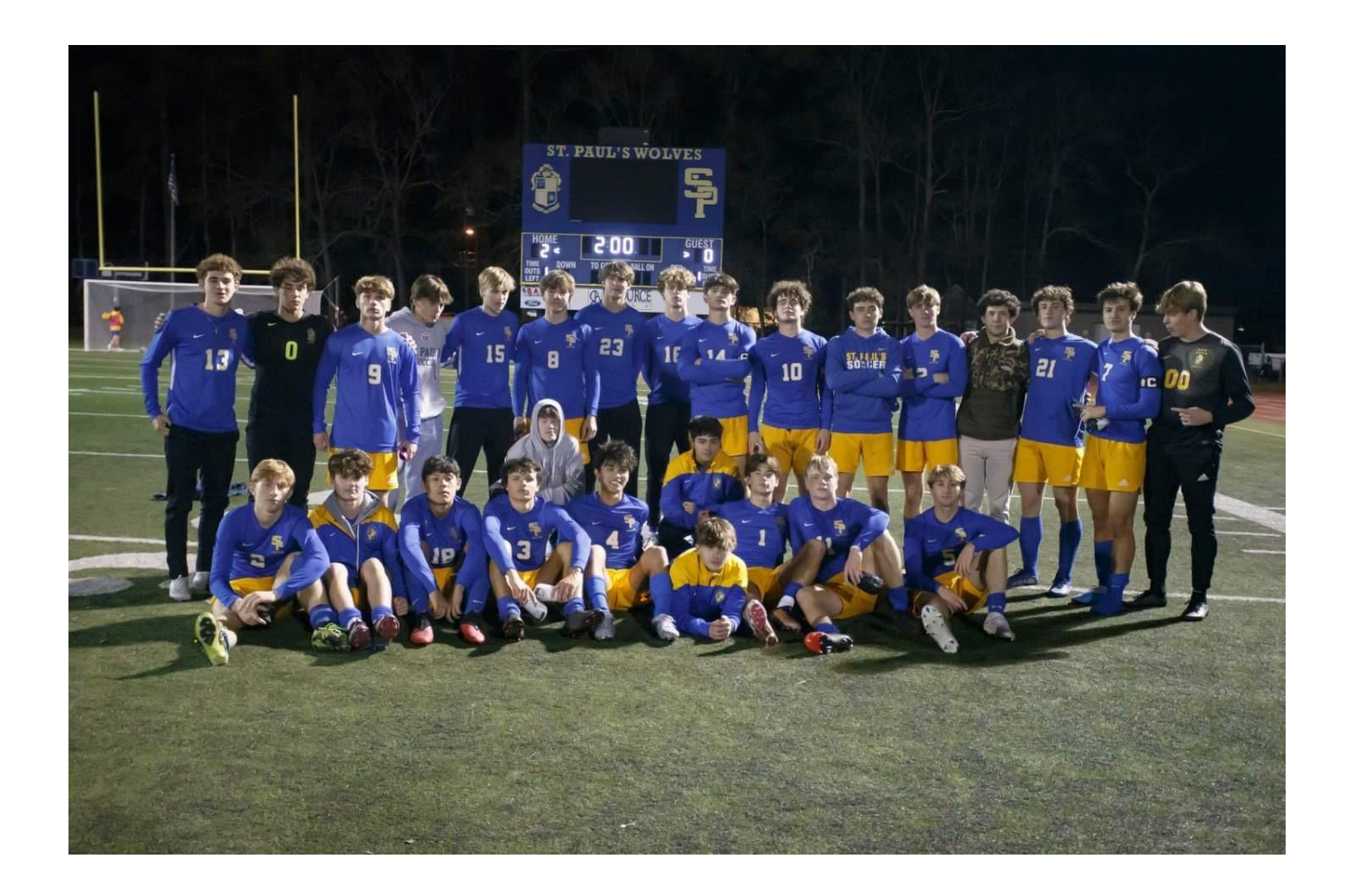
Varsity Soccer team after their 2-0 win over Mandeville in the Semi-Finals