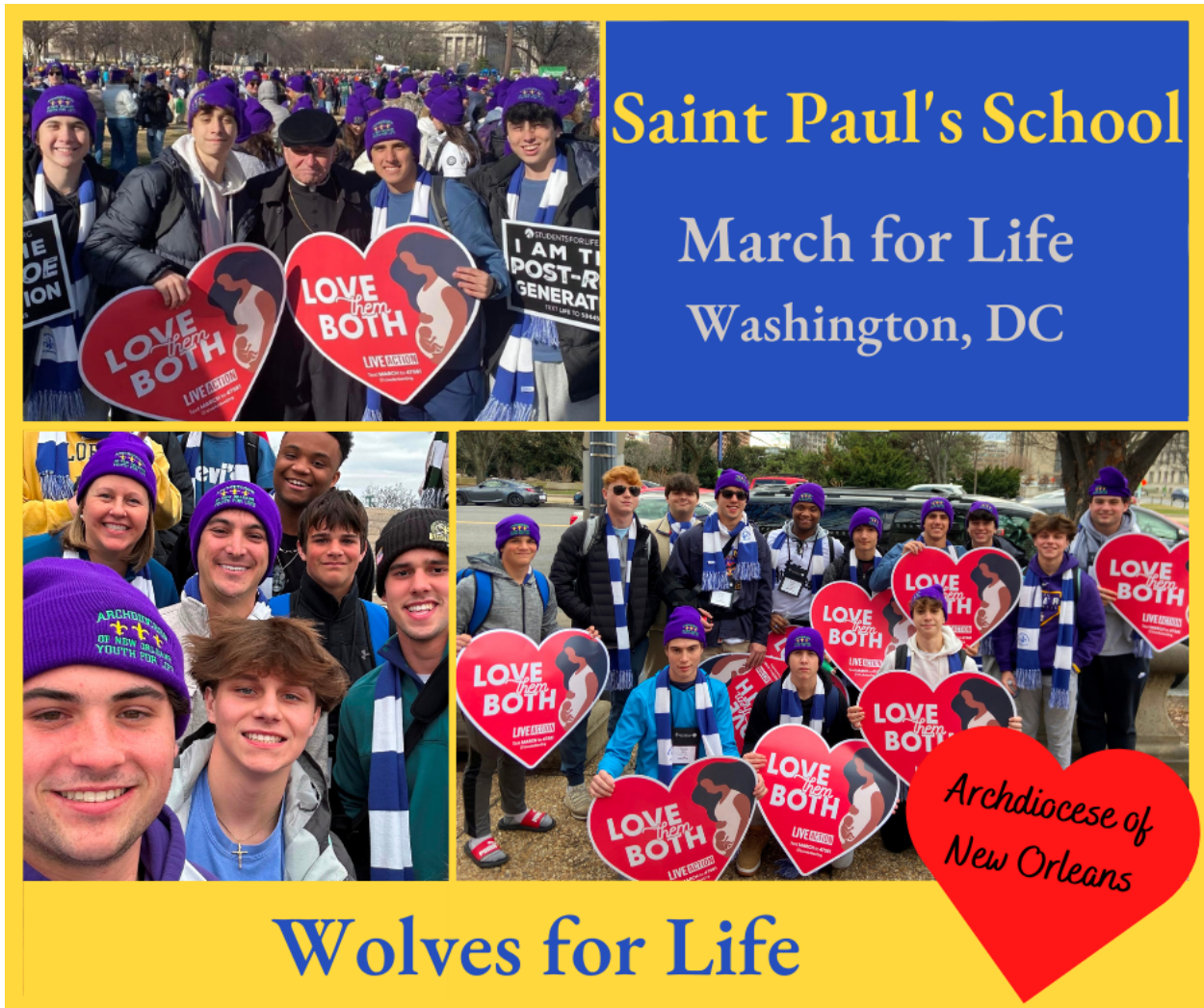
SPS students traveled to Washington D.C. for the recent March for Life event.