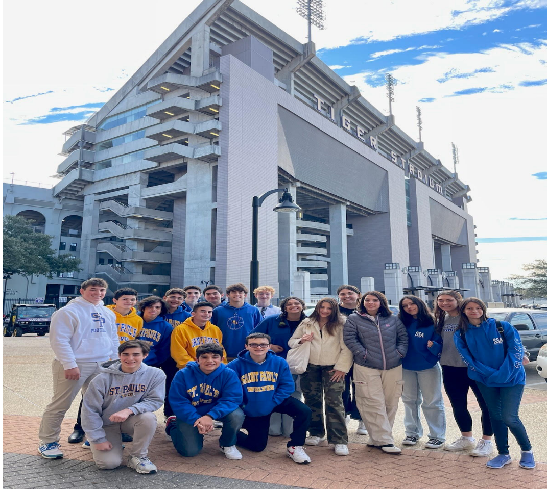
Students from SPS, SSA, and La Salle College (Costa Rica) enjoy visiting LSU's campus.

LUNCH DROP-OFF (there is no such thing): Do not pull onto campus to drop lunch off to your son during lunch or at any time. This is against school policy. Please plan ahead.