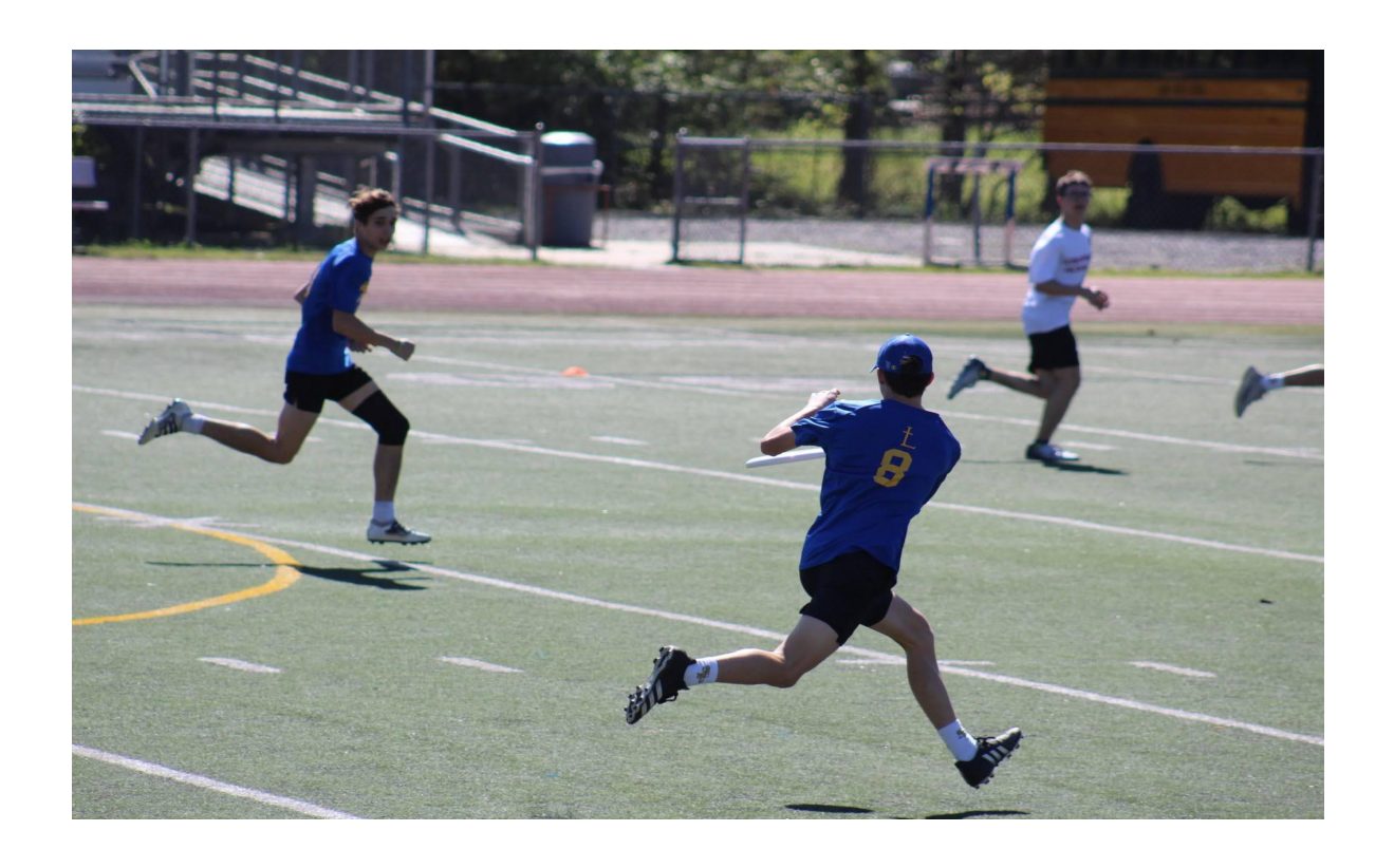
Above: Ultimate Frisbee in action. Below: The team