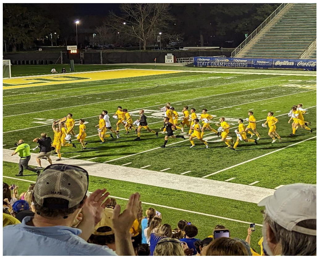
Soccer team celebrates with their fans after the 2-0 State Championship win.

https://www.nola.com/news/communities/st_tammany/st-pauls-claims-11th-soccertitle-with-win-over-dutchtown/article_2bbd747e-b552-11ed-acf0-63f4bcf79c72.html