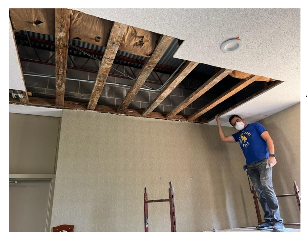
St. Paul's Maintenance Crew repairing ceiling damage from a recent roof leak at Our Lady of Peace Student Chapel.

women take great pride in maintaining and cleaning our 40-acre campus and 14 buildings every day. Safety is always our primary concern and there is much work behind the scenes that this crew handles as well. I am proud to say that our annual safety inspections by various state agencies are usually flawless, with only one or two minor notes (a blinking exit light in the last inspection). I am also happy to say that, for the most part, our students take pride in their school campus as well. Please remind your sons how lucky they are to attend such a beautiful, well-equipped, and maintained school. Please also remind them to do their part to help our maintenance crew keep it that way and even improve it more.