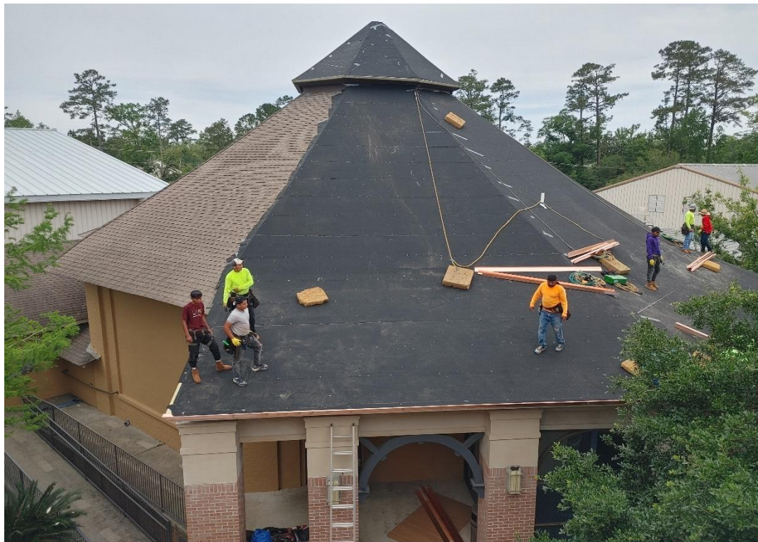
Left: Work on Theater roof during renovation.

Interested in assisting us in funding this project? Several naming opportunities are available!