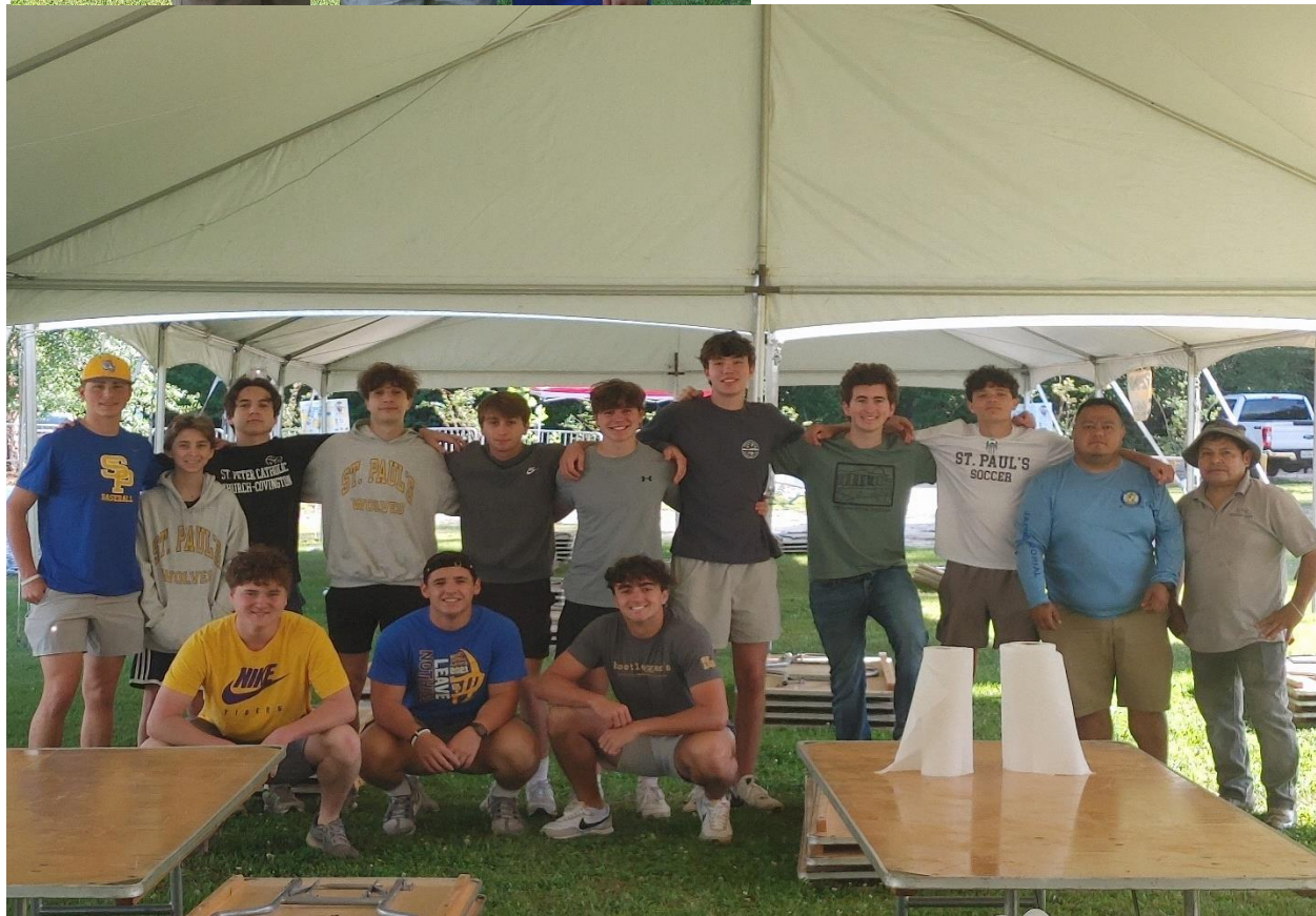
Above: A group of volunteer students assist SPS maintenance crew in getting the campus cleaned up after the Crawfish Cookoff.