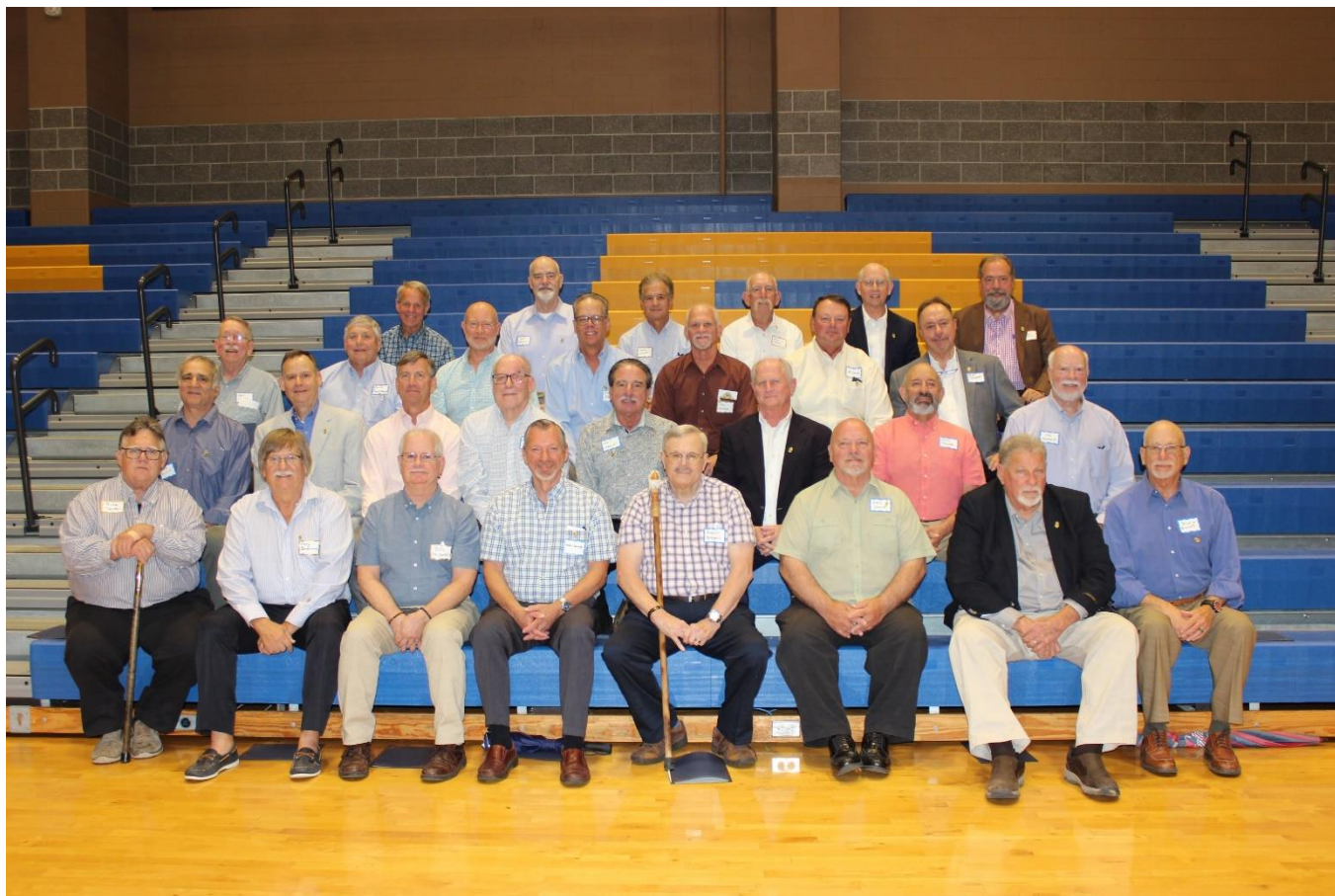
Above: New Members of the Confraternity of Golden Jubilarians of 1973 gather in the New Gym after the assembly.

GOLDEN JUBILARIAN ASSEMBLY: Every year St. Paul's holds a reunion honoring the graduates from 50 years ago. This year the class of 1973 were honored guests at the weekly assembly. During this assembly we also take the opportunity to induct the senior class into the Alumni Association. The golden jubilarians assist us in the induction by personally welcoming the class of 2023 as alumni and pinning each with a St. Paul's crest pin.