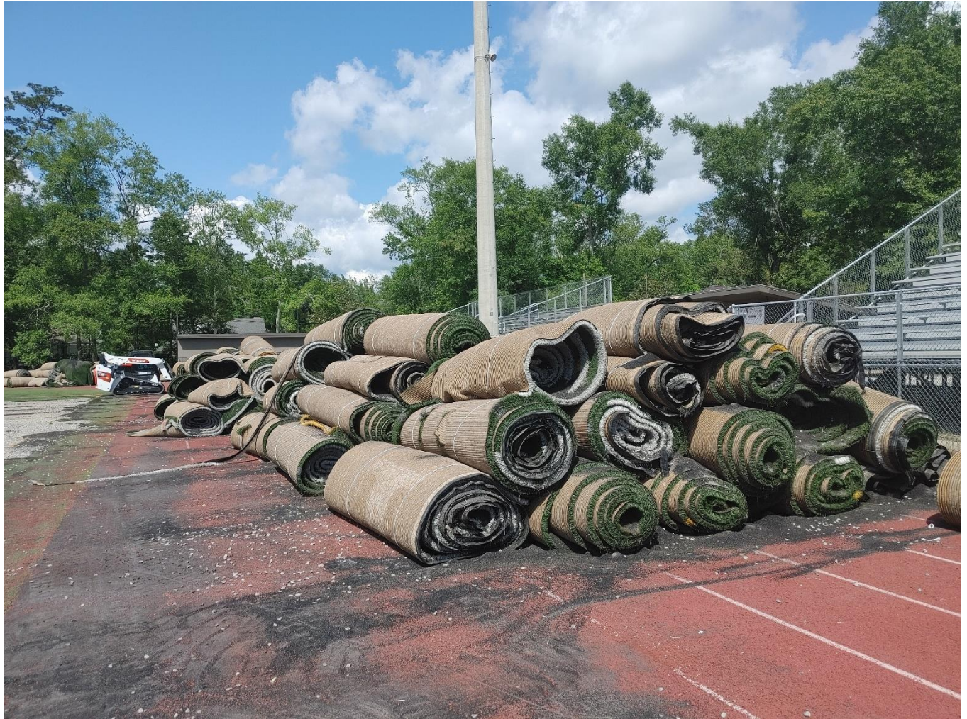
Above: The old field surface awaits disposal.

ANNUAL APPEAL AND GRANDPARENTS: We are blessed with many supportive grandparents. Many schools solicit donations from grandparents directly. Again, I do it differently than other schools that directly solicit grandparents. I ask that you inform your son's grandparents or, if you want, I'll be happy to send them the information directly if you wish. Just provide me with the information. I do not want to ask grandparents without your consent but we need their support. I have already received a number of grandparent gifts. Again, no gift is too small – and, of course, no gift is too large.