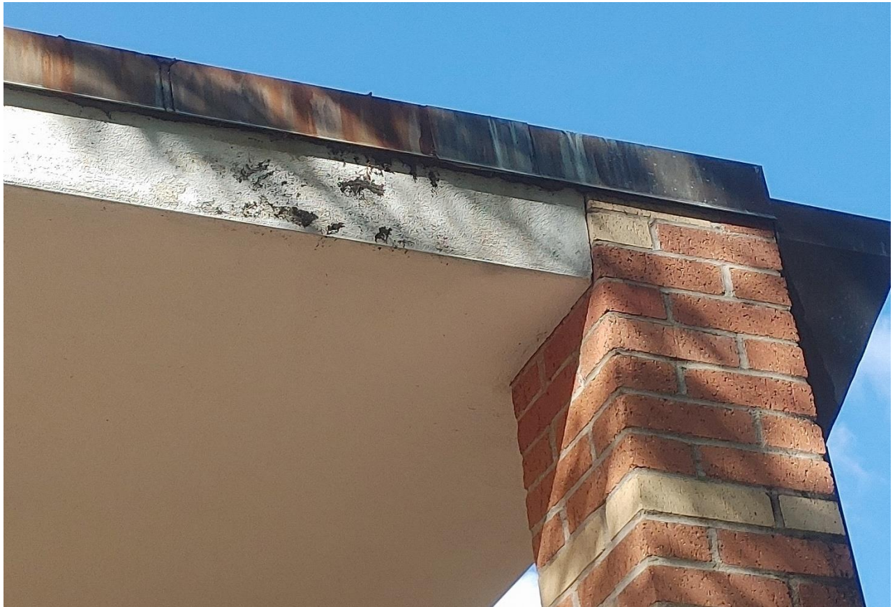
Flashing and fascia show their age at Our Lady of Peace Student Chapel.

Interested in helping fund these repairs and improvements to the chapel? Please give me a call.