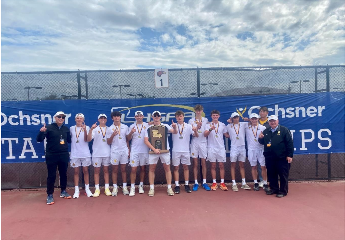
Above: Tennis team celebrating their State Championship!

STUDENT COUNCIL OFFICERS: Congratulations to the following students who were elected to Student Council offices for 2023-2024.