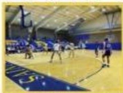
June 3-7: Basketball