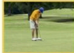
June 24-28: Golf