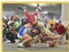
July 15-19 - Wrestling