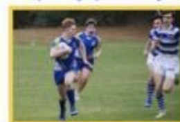
July 15-19 - Rugby