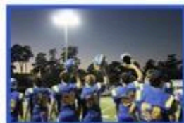
June 10-14: Football