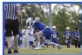
July 15-19 - Lacrosse