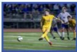
June 24-28: Soccer