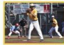
June 17-21: Baseball