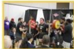
June 24-28: Strength