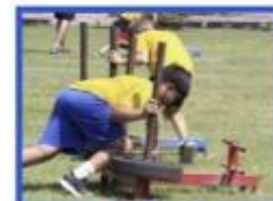
July 8-12: S.A.S Speed, Agility, and Strength